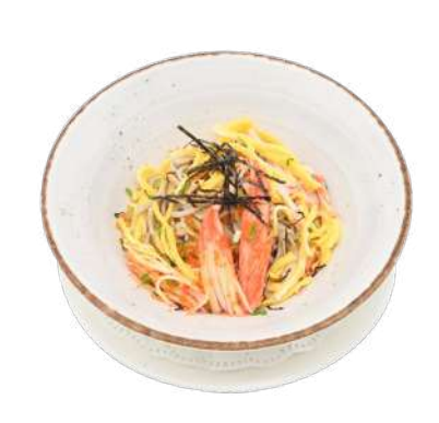
Kanifumi Cold Soba $14.80+ Available from: