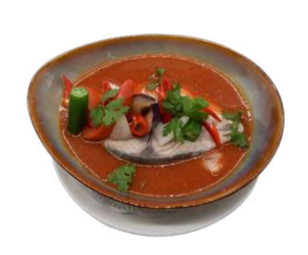
Asam Pedas Batang Fish (served with rice) $14.80+