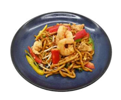
Monday Seafood Fried Udon $14.80+