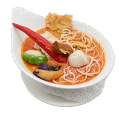
Laksa Yong Tau Foo $14.80+