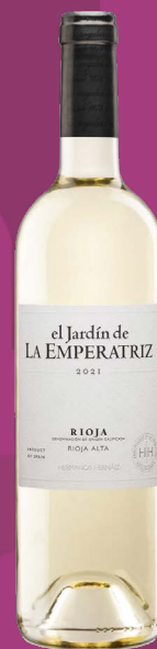
El Jardín de la Emperatriz White 2021 $55+

Prices stated are subject to prevailing GST and surcharge for non members.