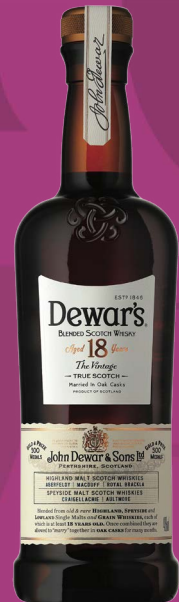
Dewar's 18yrs $148+