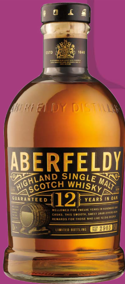
Aberfeldy 12yrs $118+

Available for the Month of March & April (Golfers' Terrace, T Bar & Water Hazard)