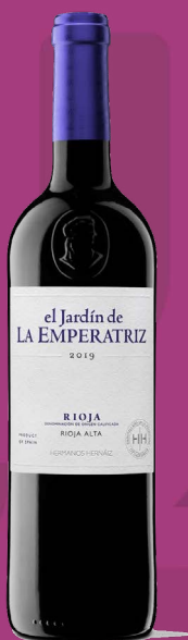
El Jardín de la Emperatriz Red Crianza 2019 $55+