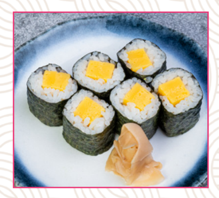
Tamago Maki-Egg Omelette Roll