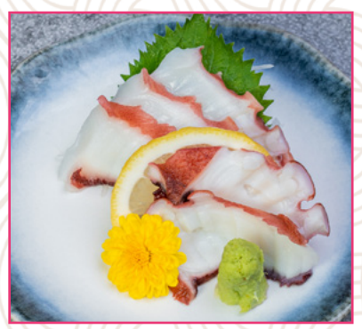
Tako-Octopus Sashimi Member $13.00 / Non-member $15.60