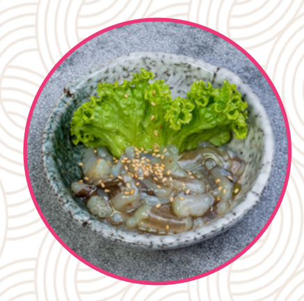
Tako Wasabi (Octopus Seasoned with Wasabi)