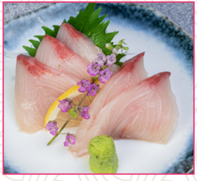
Hamachi-Yellow Tail Sashimi