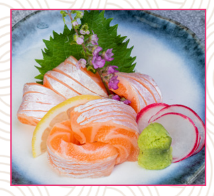
Shake-Toro Salmon Belly Member $13.00 / Non-member $15.60