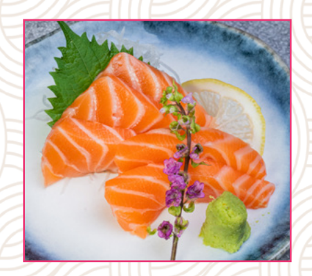
Shake-Salmon Sashimi Member $12.00 / Non-member $14.40