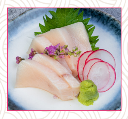
Mekajiki-Swordfish Sashimi Member $15.00 / Non-member $18.00