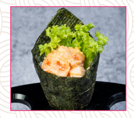
Lobster Salad Handroll Member $6.00 / Non-member $7.20