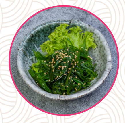
Chuka Wakame (Seasoned Seaweed)