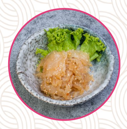
Chuka Kurage (Seasoned Jellyfish)