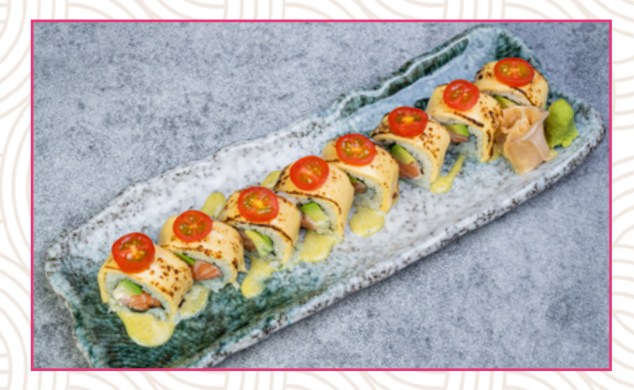
Aburi Cheese Salmon Avocado Roll