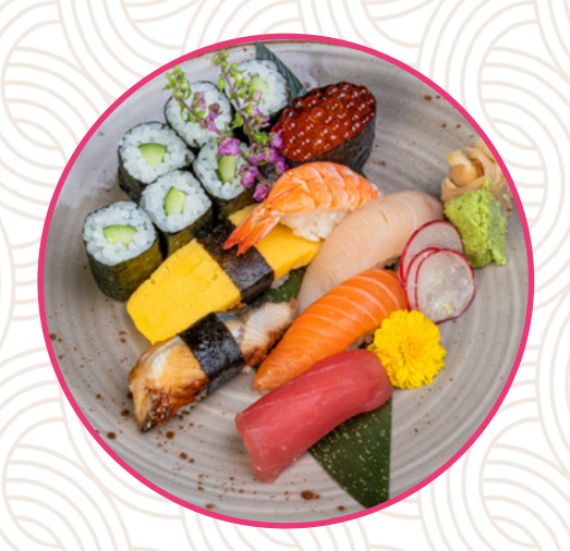
Nigiri Sushi Set Member $18.80 / Non-member $22.60