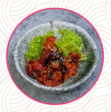
Chuka Idako (Seasoned Baby Octopus)