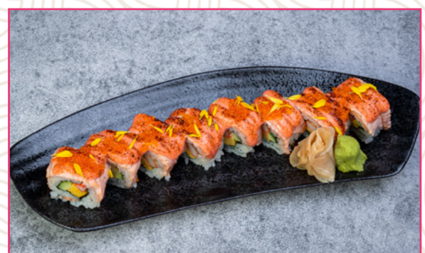
Aburi Salmon Mentai Roll