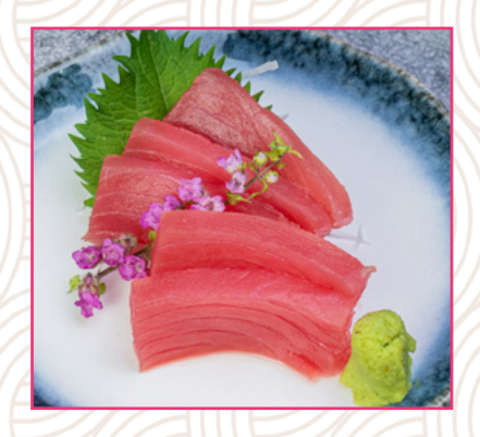
Maguro-Tuna Sashimi Member $15.00 / Non-member $18.00