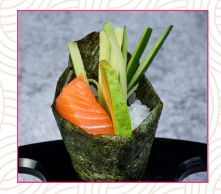
Salmon Avocado Handroll Member $6.00 / Non-member $7.20