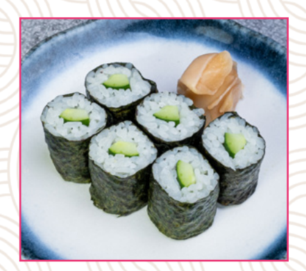
Kappa Maki-Cucumber Roll