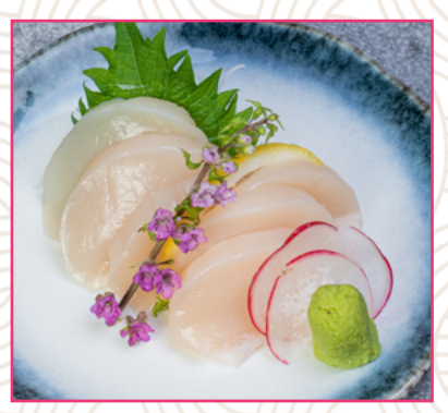
Hotate Scallop Sashimi Member $16.00 / Non-member $19.20