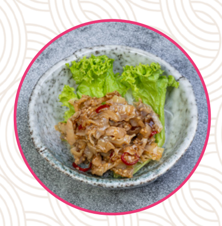
Chuka Hotate (Seasoned Scallop Skirting)