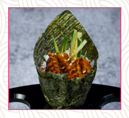
Unagi Handroll Member $6.00 / Non-member $7.20