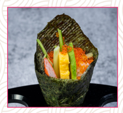
California Handroll Member $6.00 / Non-member $7.20