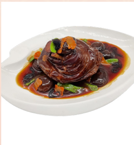
Braised Pork Knuckle with Fatt Choy & Black Mushroom