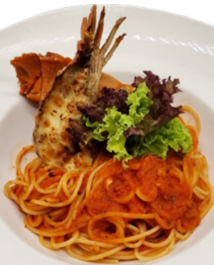
Cheese Baked Crayfish with Spaghetti $24.00+