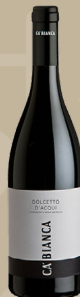
Ca Bianca Dolcetto Dacqui Doc 2020, Piedmont-Italy $58+

Prices stated are subject to prevailing GST and surcharge for non members.