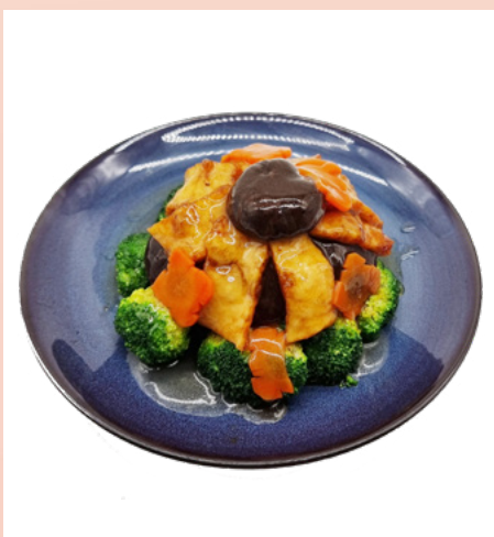
Broccoli with Fish Maw & Black Mushroom