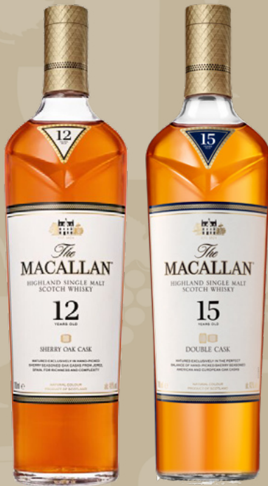
Macallan 12yrs Sherry Oak + Macallan 15yrs Double Cask $388+

Available for the Month of January & February (Golfers' Terrace, T Bar & Water Hazard)