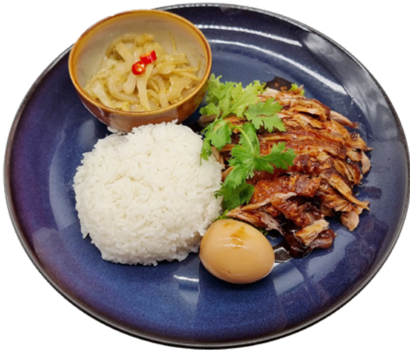
Thai Style Braised Pork Knuckle with Rice $14.80+