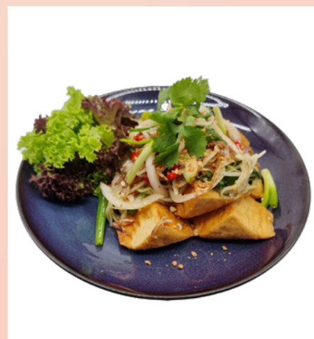
Spicy Thai Style Beancurd