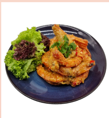
Buttered Salted Egg Yolk Tiger Prawns