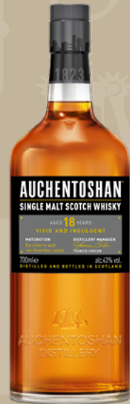
Auchentoshan 18yrs $158+