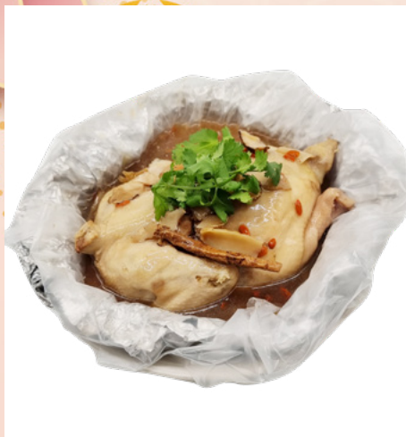
Emperor Herbal Chicken