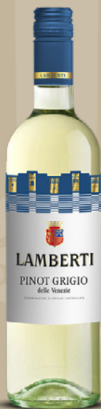
Lamberti Pinot Grigio Delle Venezie Doc 2021, Veneto Italy $48+