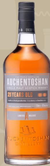
Auchentoshan 21yrs $278+