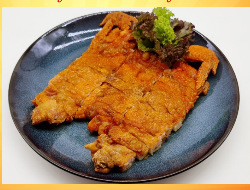
Golden Dragon Chicken $38.80+