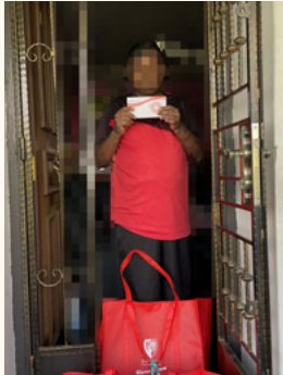
Beneficiaries receiving goodie bags and vouchers from Warren volunteers.