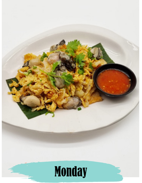
Fried Oyster Omelette (Orh Luak) $13.80+