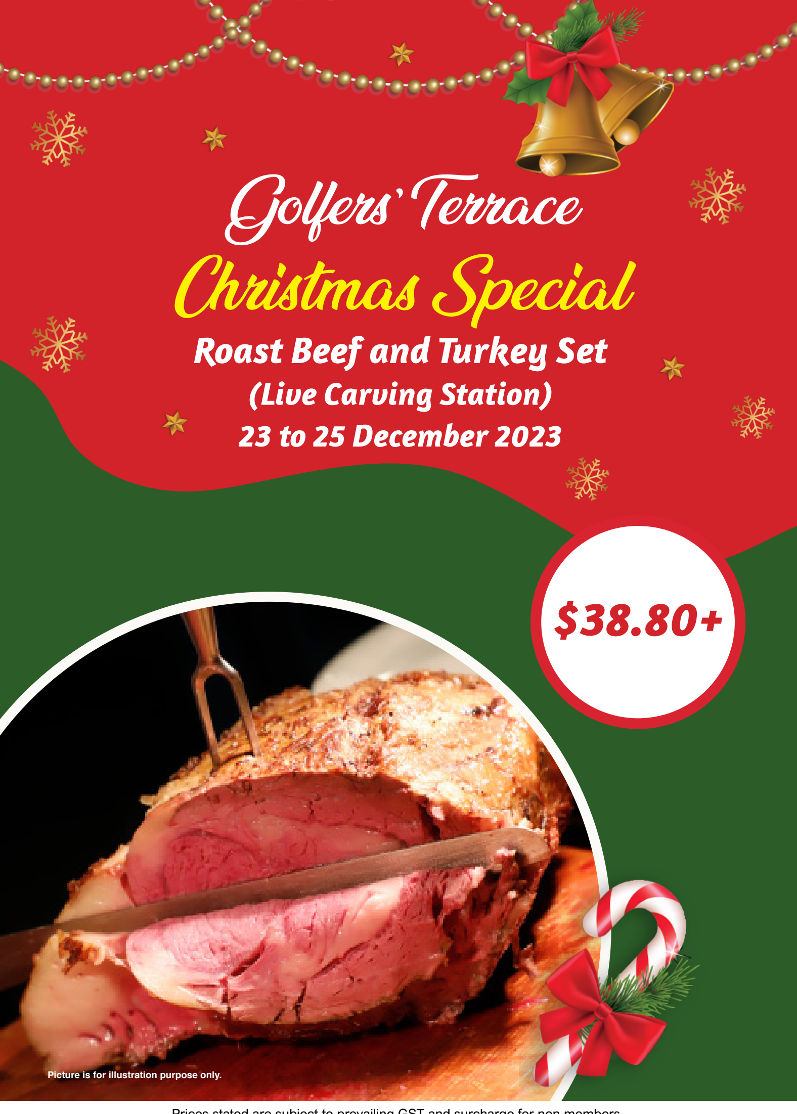
Prices stated are subject to prevailing GST and surcharge for non members.