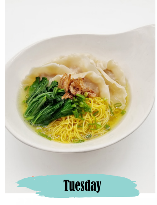
Prawn Dumpling Noodle Soup $13.80+