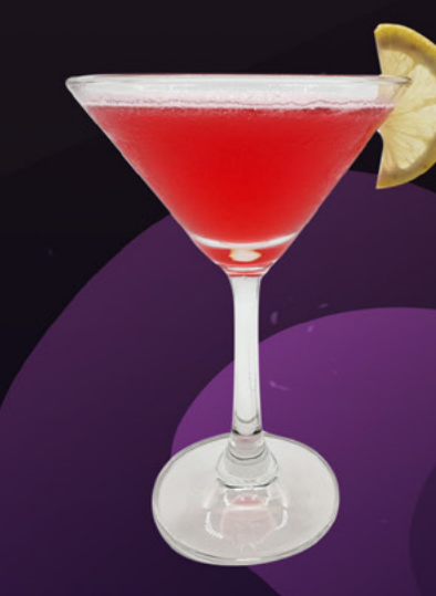
Friday Fluffy Critter $10+