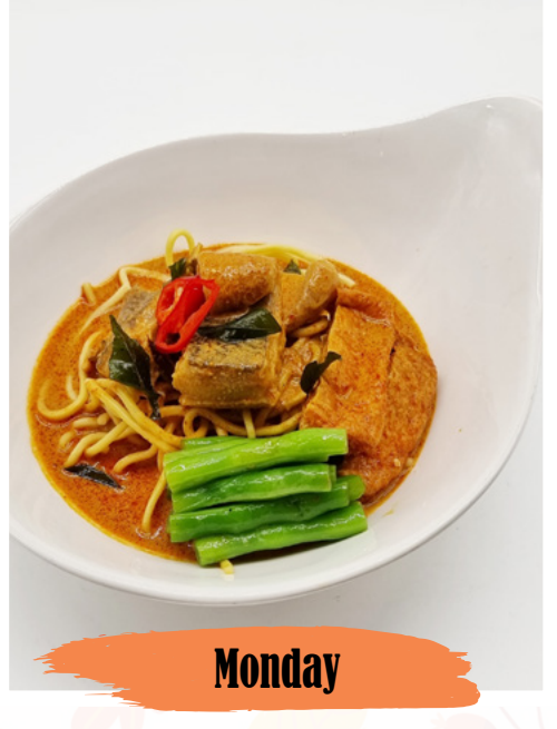
Curry Noodles with Stingray $14.80+