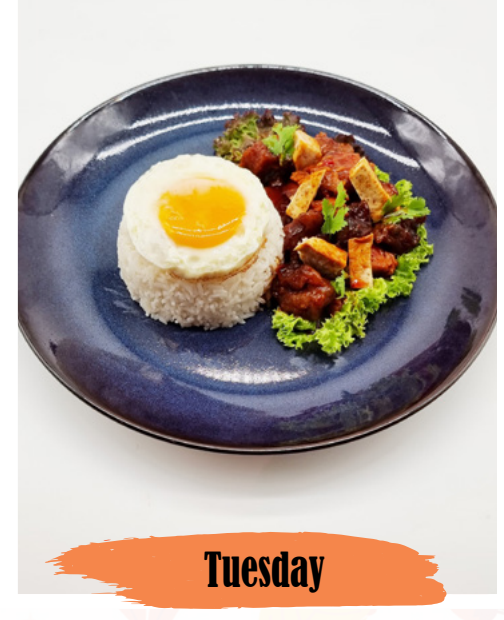
Braised Yam and Ribs with Rice $14.80+