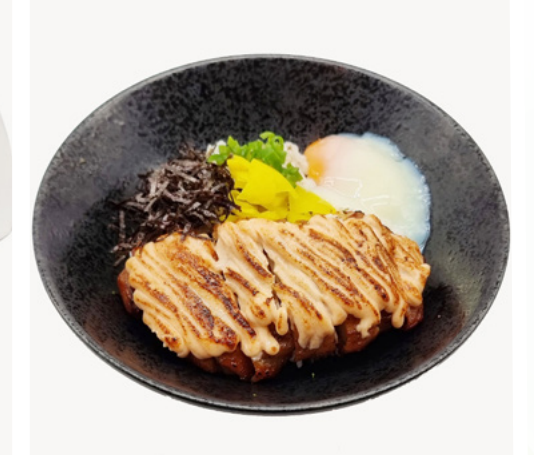
Tori Mentaiko Don $14.80+