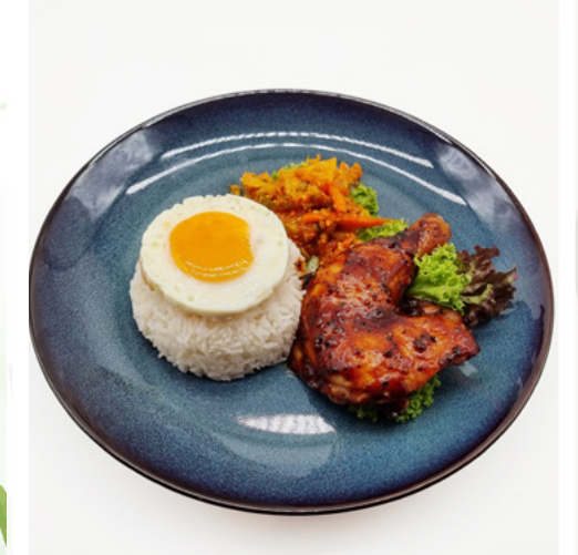
Grilled Chicken in Black Pepper Sauce with Rice $14.80+