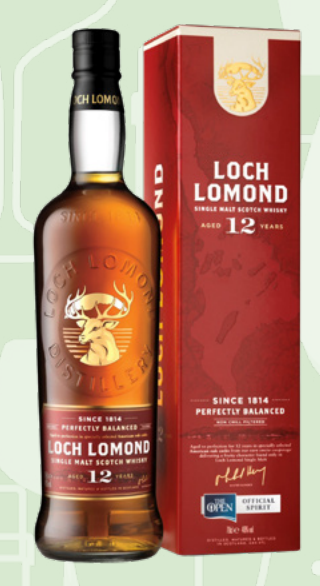
Loch Lomond 12yrs $128+