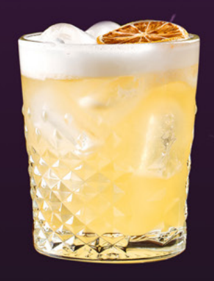
Wednesday Whisky Sour $10+