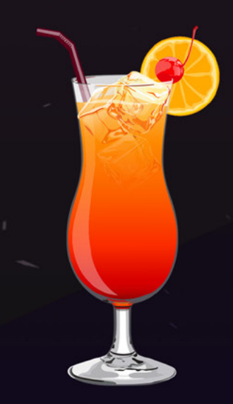
Thursday Tequila Sunrise $10+