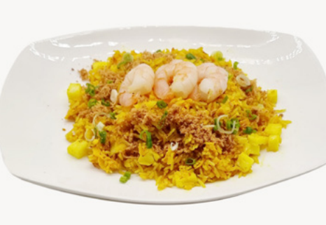
Thai Pineapple Fried Rice $13.80+