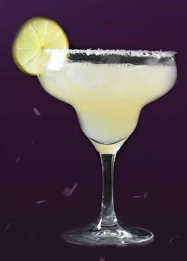
Monday Margarita $10+

Available for the Month of November and December