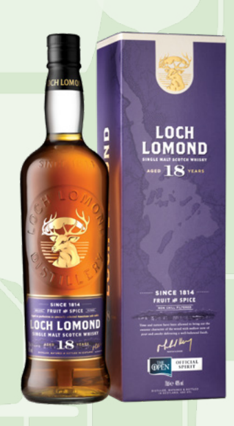
Loch Lomond 18yrs $168+