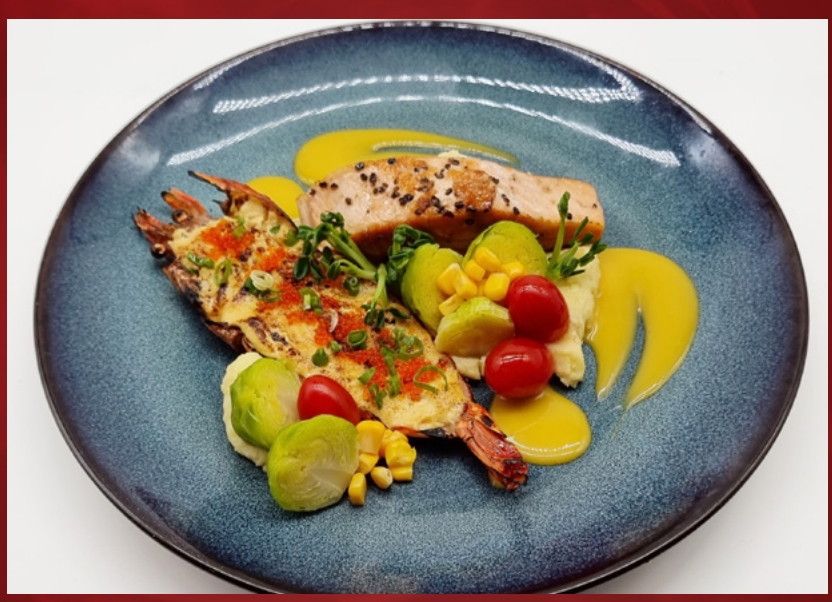
Tiger Prawn and Salmon with Citrus Cream Sauce $23.80+

Prices stated are subject to prevailing GST and surcharge for non members.