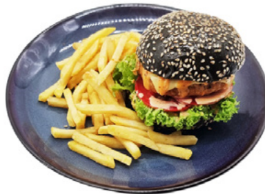
Charcoal Chicken Burger