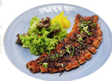
Unagi Kabayaki (Grilled Eel)