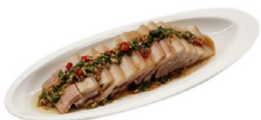
Boiled Sliced Pork with Garlic Sauce