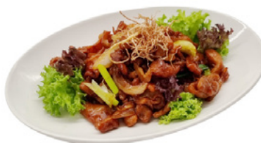
Deep-Fried Sliced Pork with Ginger Sesame Oil