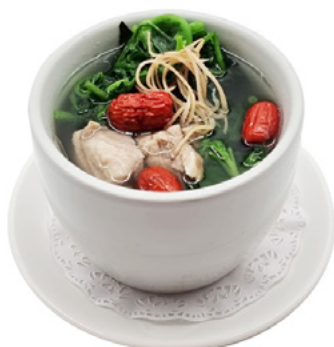
Double Boiled Watercress Pork Rib Soup