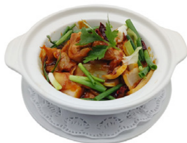
Claypot Kung Pao Chicken