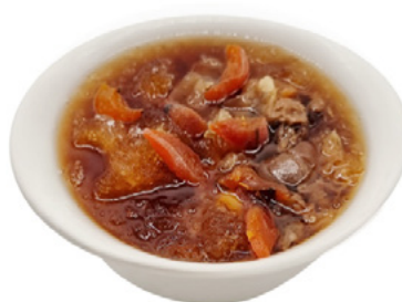
Cheng Tng ( Hot / Cold )