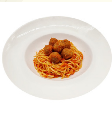
Mock Meat Ball Pasta