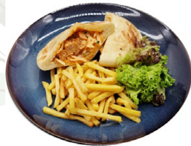
Tandoori Chicken with Pita Bread