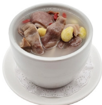
Double Boiled Pig Stomach Soup