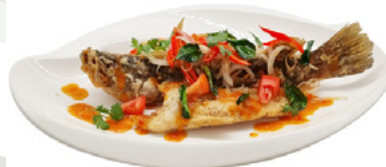
Deep-Fried Seabass with Bangkok Sauce