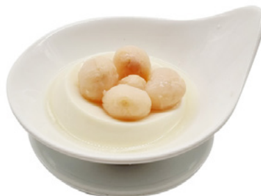
Soya Beancurd with Lychee