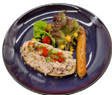
Tuna on Toast