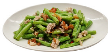
Stir-Fried Green Beans with Minced Pork