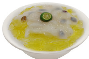
Ice Jelly with Soursoy