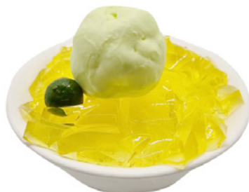
Ice Jelly with Lime Sherbet