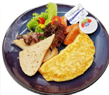
Cheese Omelette with Cocktail Sausage