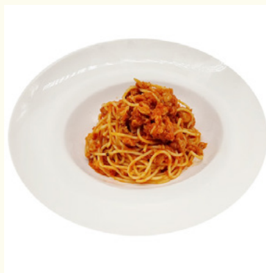
Mock Minced Meat Bolognese Pasta