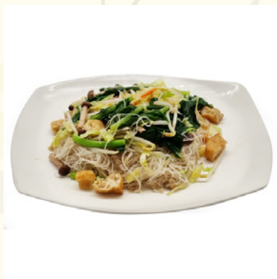
Mock Meat Fried Beehoon

"Dynameat believes in replacing animal meat with plant-powered meat as an effort to answer the global concerns that are on a rise due to eating and production of meat."