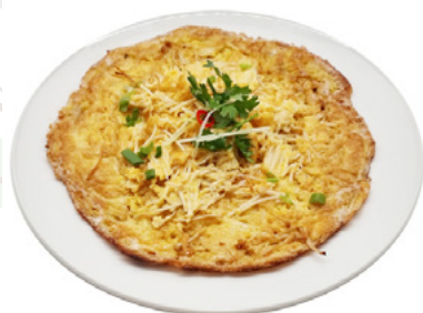
Golden Mushroom Omelette