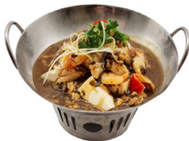
Braised Beancurd with Chinese Olive and Seafood