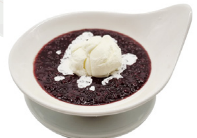
Cold Black Glutinous Rice with Coconut Ice Cream