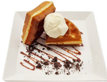
Waffle with Ice Cream