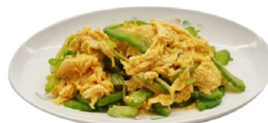
Fried Bittergourd Egg