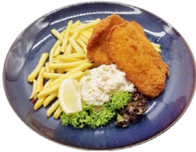
Fish & Chips