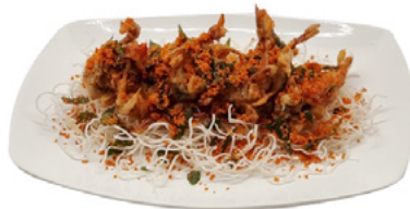
Typhoon Shelter Soft Shell Crab