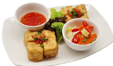
Crispy Five-Spiced Beancurd with Thai Sauce