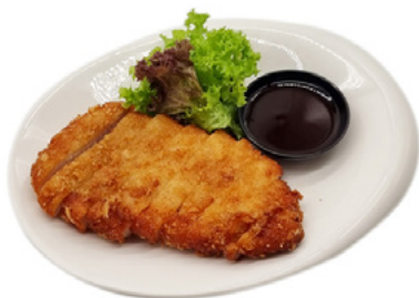
Crispy Pork Cutlet with Tonkatsu Sauce