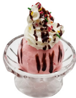
Single Scoop Ice Cream