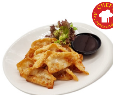
Crispy Shrimp Gyoza