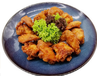
XO Chicken Wing