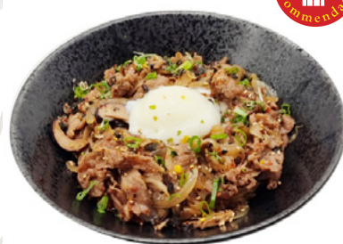
Truffle Iberico Pork Don