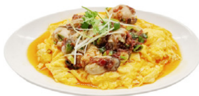
Stir-Fried Sambal Oyster Egg