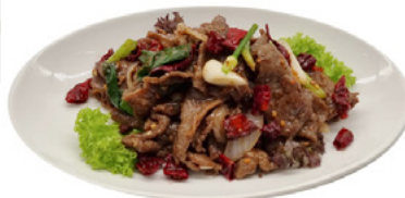
Stir-Fried Sliced Beef in Chilli and Cumin Spices