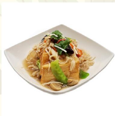
Braised Beancurd with Golden Mushroom and Mock Meat