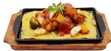
Sizzling Prawn with Homemade Sauce