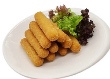
Mozzarella Cheese Stick