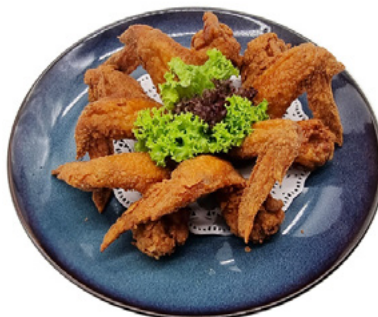
Original Chicken Wing