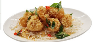
Cereal Prawn Ball