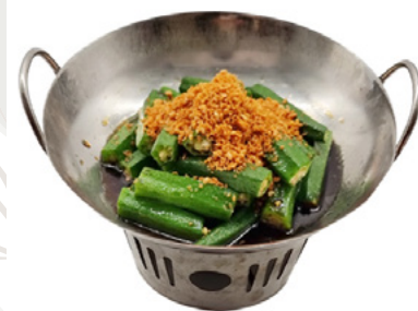
Lady's Finger with Crispy Garlic