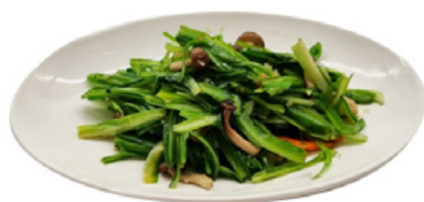
Stir-Fried Qing Long Cai with Salted Fish