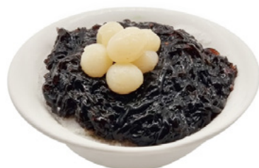
Chin Chow Longan / Attap Seed