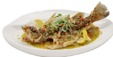
Deep-Fried Seabass with Thai Lime Sauce