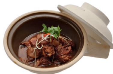
Young Ginger Braised Duck