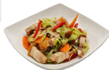
Stir-Fried Chinese Leeks with Roasted Pork