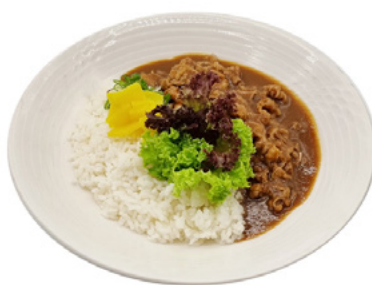
Yakiniku Curry Rice