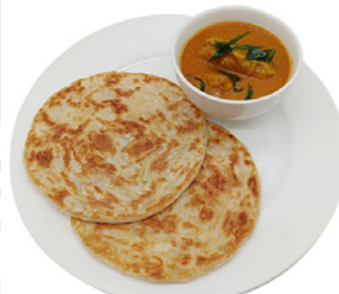
Roti Prata with Chicken Curry