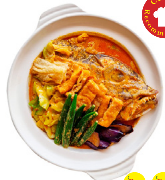
Warren Curry Fish Head