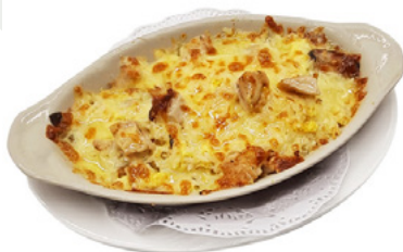
Chicken and Mushroom Baked Rice