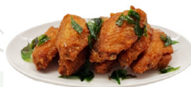
Kari Ayam Goreng