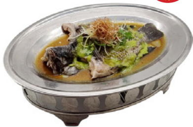
Steamed Tilapia with Ginger Paste