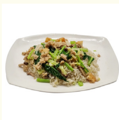
Mock Meat Fried Rice