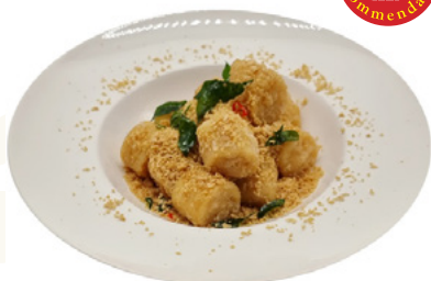
Butter Cereal Egg Tofu