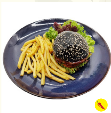
Mock Meat Burger