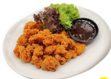
Spicy Popcorn Chicken