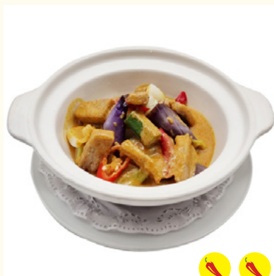
Mock Fish Curry