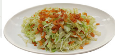
Cabbage with Dried Shrimps