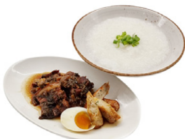
Teochew Porridge (Meicai with Pork Belly, Half Salted Egg, Ngoh Hiang)