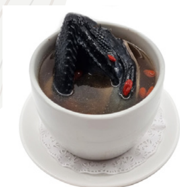
Double Boiled Black Chicken Herbal Soup