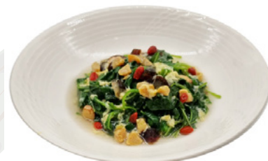
Chinese Spinach with Trio Eggs