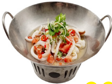
Steamed Squid with Garlic Lemon Sauce