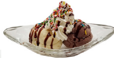
Double Scoop Ice Cream