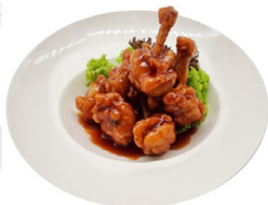
Chicken Boxing glazed with Red Wine Sauce