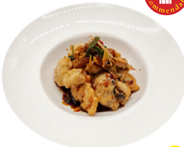
Thai Style Deep-Fried Sliced Fish in Trio Flavour