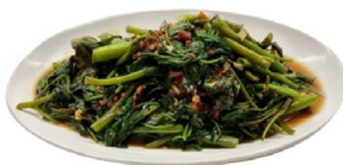
Sambal Kang Kong