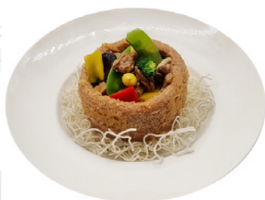
Golden Yam Ring with Mixed Vegetable