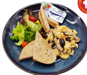
Mushroom Scrambled Egg