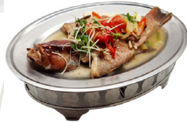
Teochew Steamed Red Garoupa