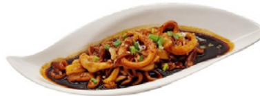
Stir-Fried Squid with Sweet Soy Sauce