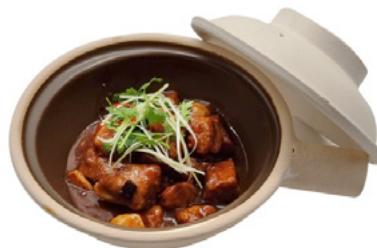
Claypot Braised Spare Ribs