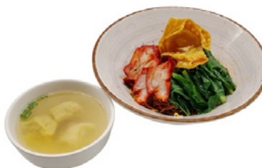
Wanton Noodle (Dry/Soup)