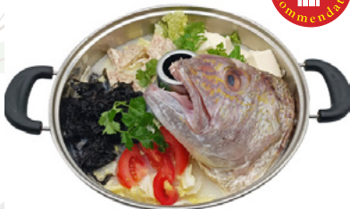
Fish Head Steamboat