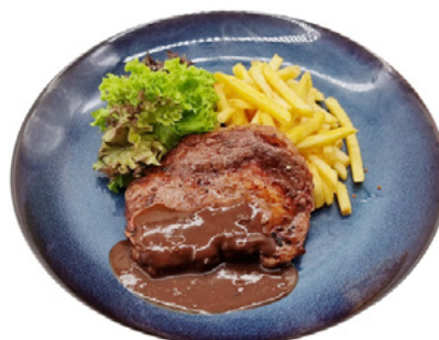
Beef Ribeye Steak