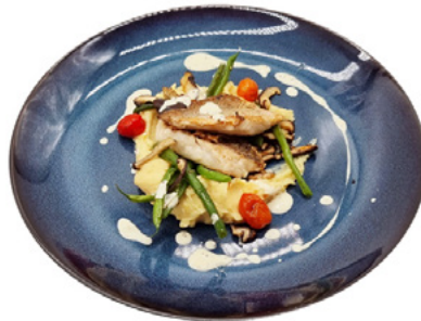
Pan-Fried Red Snapper with Honey Mustard