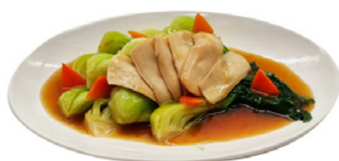
Xiao Bai Cai with GuiFei Abalone Sliced