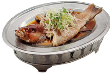
HongKong Style Steamed Red Garoupa