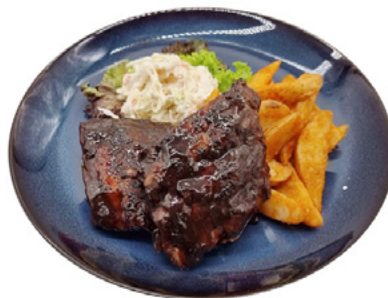
BBQ Pork Ribs