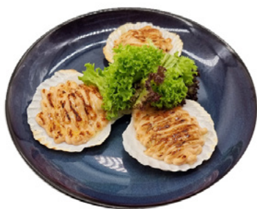
Scallop with Mentaiko Sauce