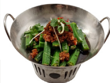
Lady's Finger with Hae Bee Hiam