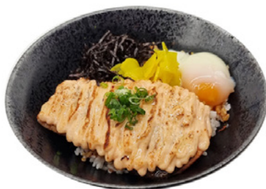
Aburi Sake Mentai Don