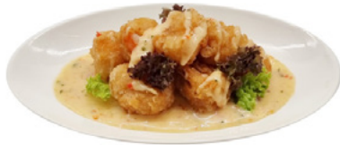
Prawn Ball with Thousand Island Sauce