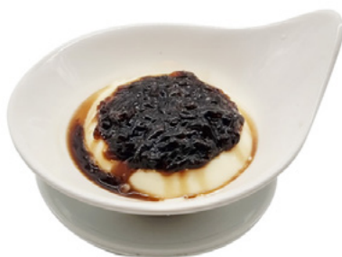
Black & White ( Soya Beancurd Mix with ChinChow )