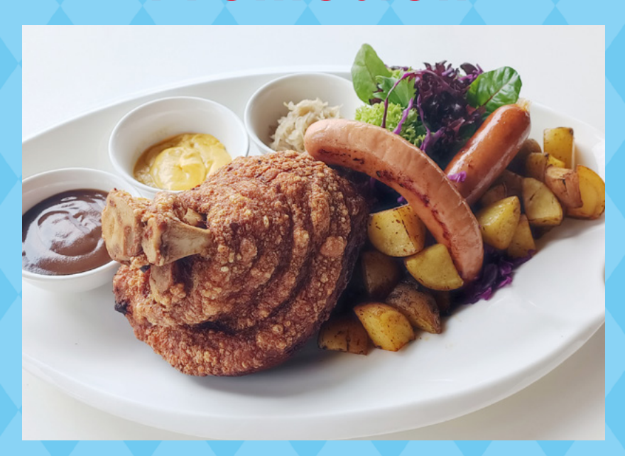
German Pork Knuckle with Sausages $68.00+