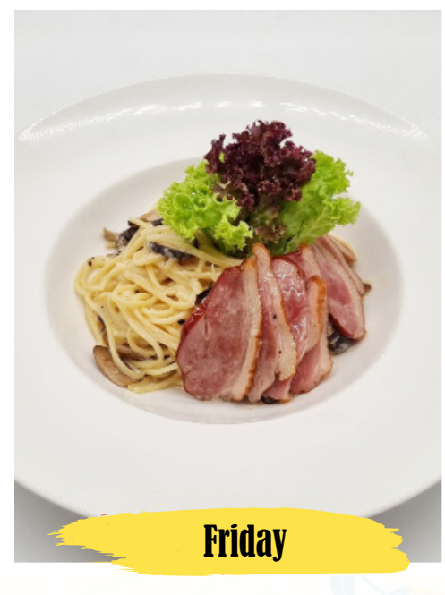
Smoked Duck Pasta $15.80+