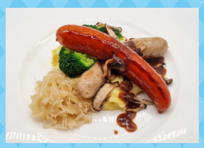
Bangers and Mash Set $28.00+