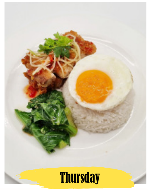
Thai Style Chicken Rice $13.80+