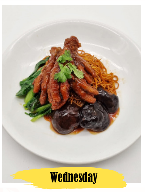
Braised Mushroom & Chicken Feet Noodles $12.80+