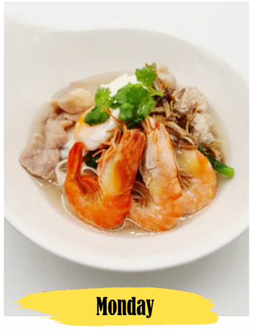
Homemade Pan Mee $12.80+