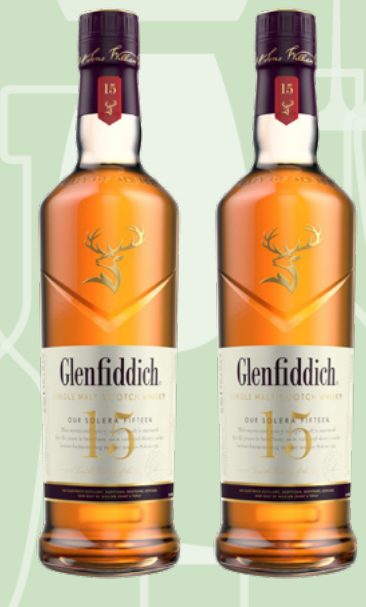
Glenfiddich 15 YO 2 for $288+

Available at Golfers' Terrace, Water Hazard & T Bar