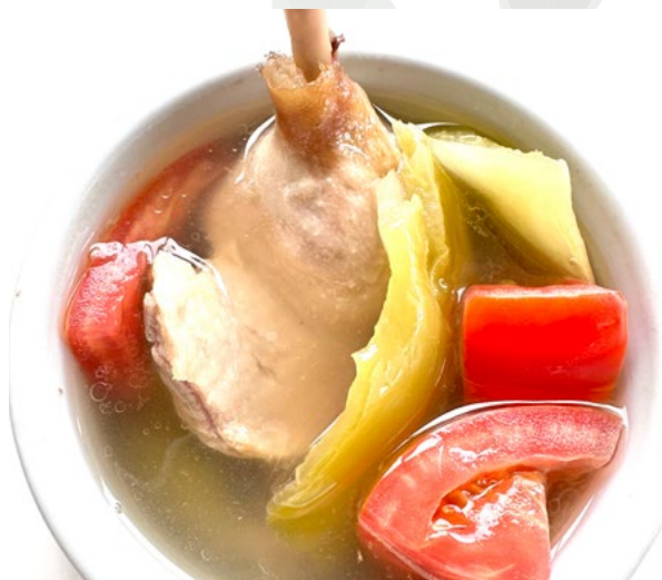
Double Boiled Duck Soup with Salted Vegetable