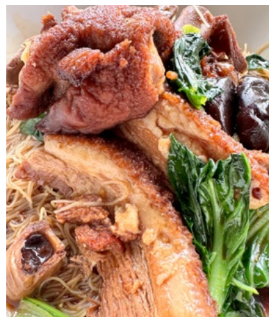
Braised Bee Hoon with Pork Trotter & Pork Belly