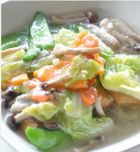
Beancurd with Mixed Vegetable