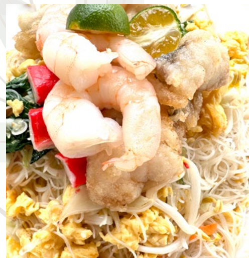
Fried Seafood Bee Hoon with Lime