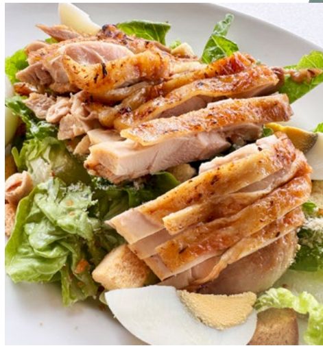
Grilled Chicken Salad