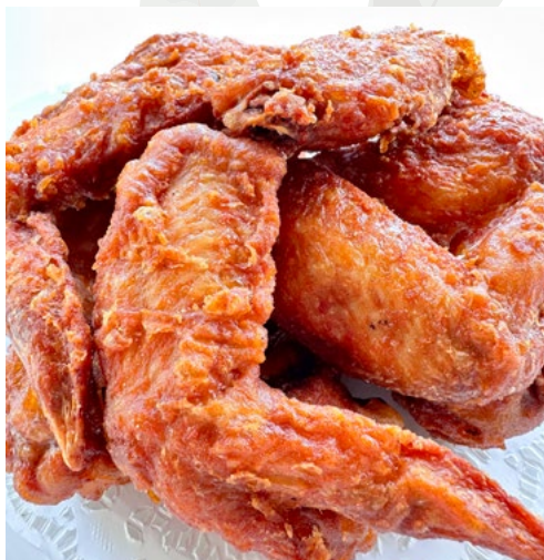
XO Chicken Wing