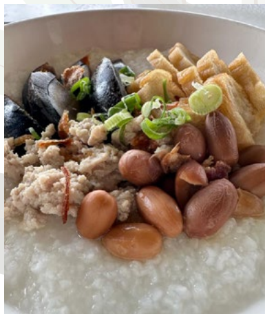
Peanut Porridge with Minced Pork, Century Egg & You Tiao