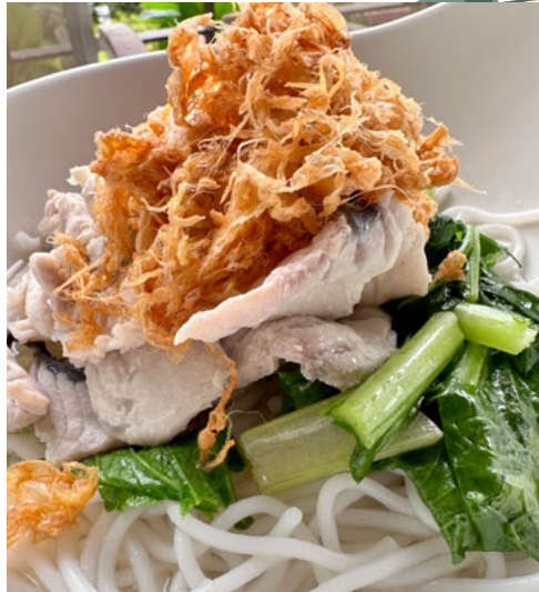
Sliced Fish Bee Hoon Soup with Crispy Egg Flower