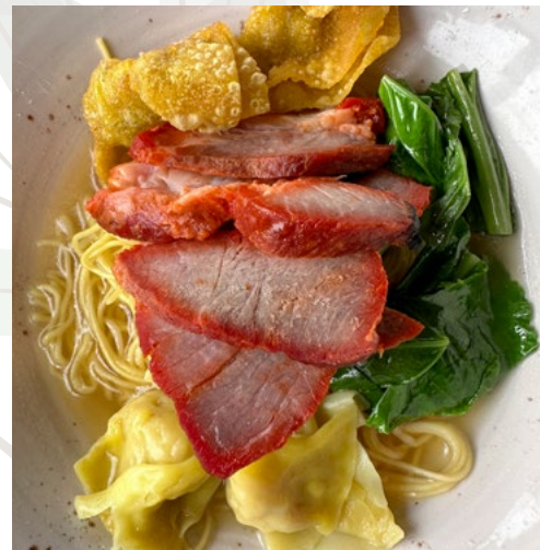
Wonton Noodle Soup