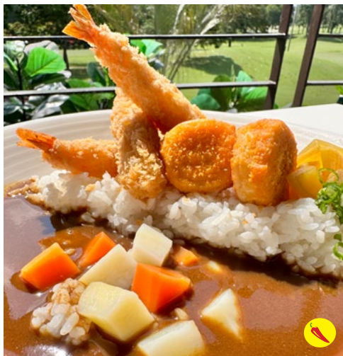
Kaisen Curry Don