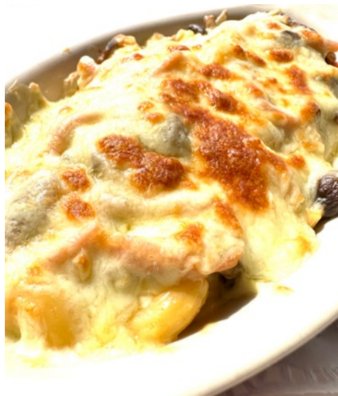
Cheese Baked Macaroni with Chicken Ham & Mushroom