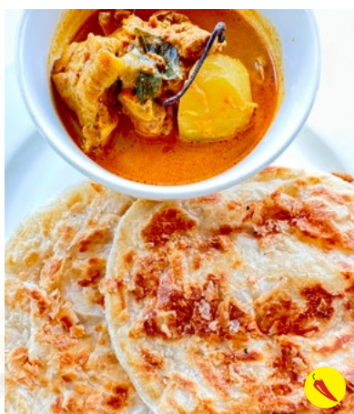
Roti Prata with Chicken Curry Sauce