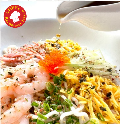
Hiyashi Ramen (Cold Ramen)