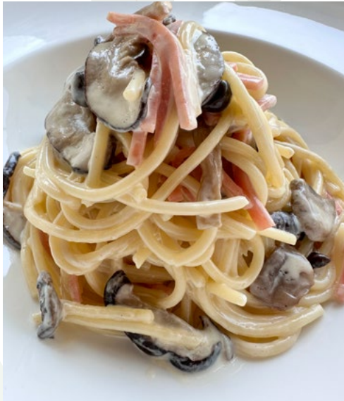
Truffle Mushroom & Ham Pasta