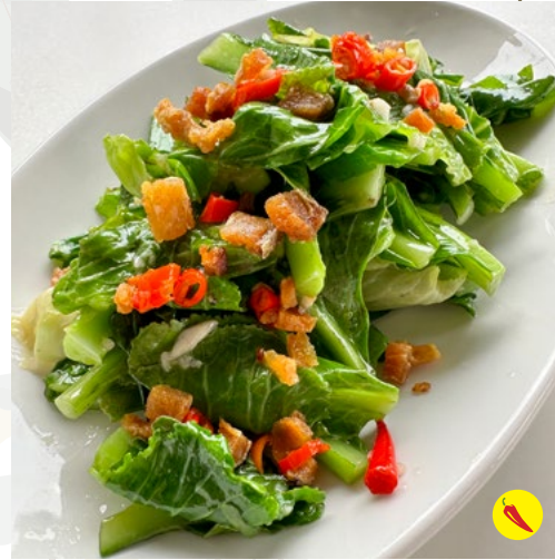
Stir-Fried Thai Baby Kailan with Salted Fish & Chilli Padi