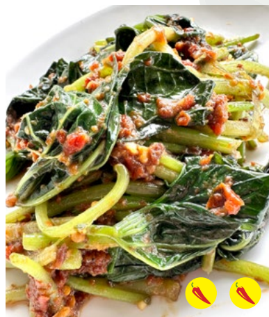
Stir-Fried Sweet Potato Leaf with Sambal