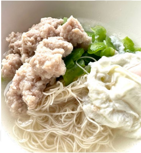
Mee Suan Soup with Minced Pork & Bittergourd