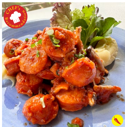
Sauteed Pork Chorizo in Spicy Tomato Sauce