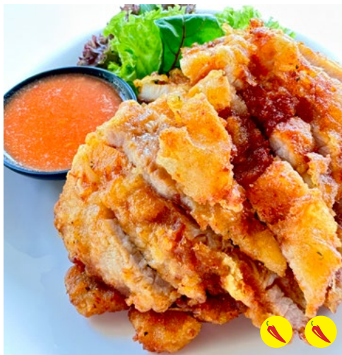
Siam Pork Belly with Chilli Dip