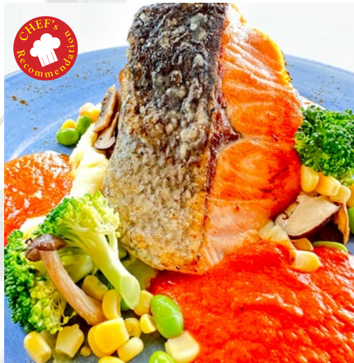
Pan-Seared Salmon with Butter Tomato Sauce