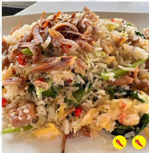
Kampong Sambal Fried Rice