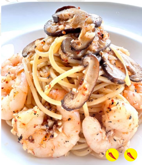
Prawn Aglio Olio