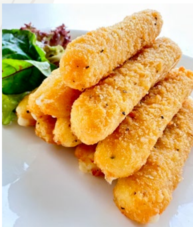
Mozzarella Cheese Stick