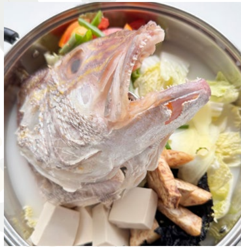
Fish Head Steamboat