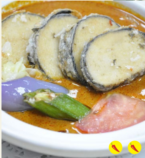
Mock Fish Curry