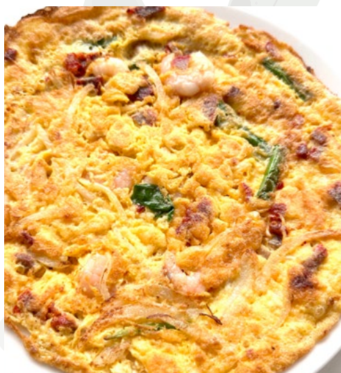
Foo Yong Egg Omelette