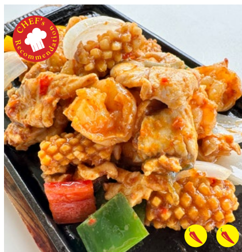
Hot Plate Chilli Seafood