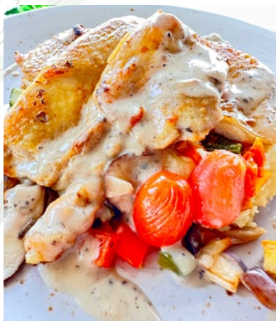
Pan-Fried Boneless Chicken Thigh with Mushroom Sauce