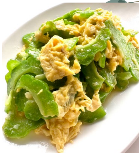
Fried Bittergourd Egg