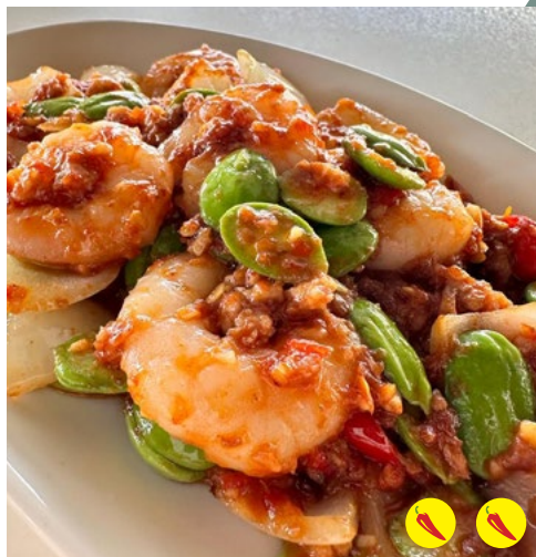
Sambal Petai Prawn