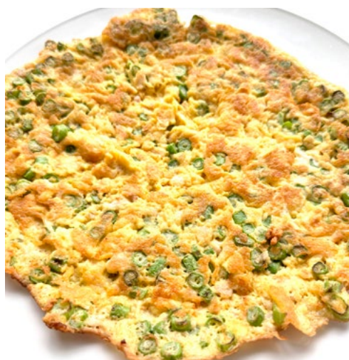
Long Bean & Minced Pork Egg Omelette