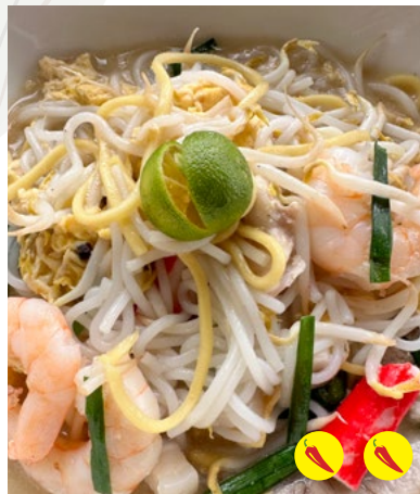
Singapore Hokkien Mee