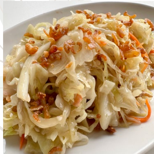
Stir-Fried Cabbage with Dry Shrimps