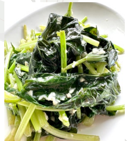
Stir-Fried Sweet Potato Leaf with Garlic