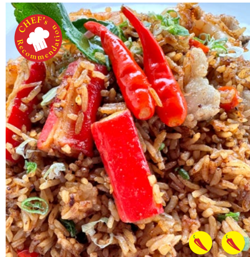
Trio Taste Seafood Fried Rice