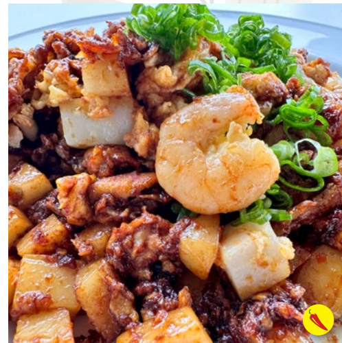
Fried Carrot Cake (Black)