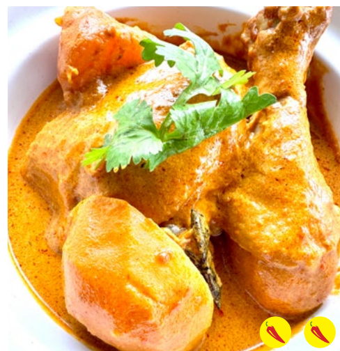
WGCC Curry Chicken with Rice