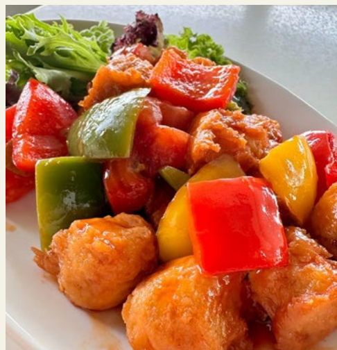
Sweet & Sour Mock Chicken