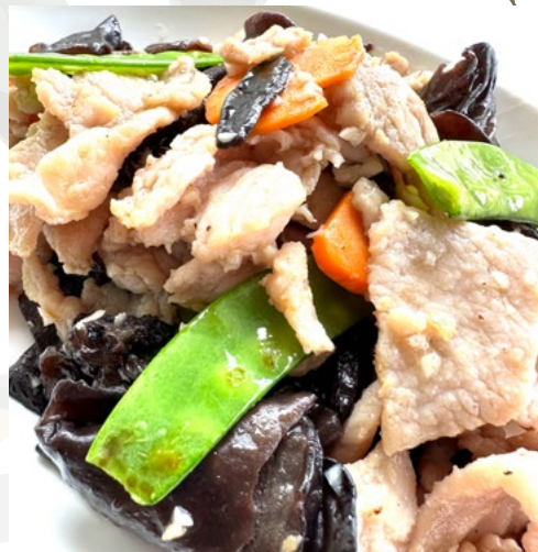
Stir-Fried Pork with Black Fungus