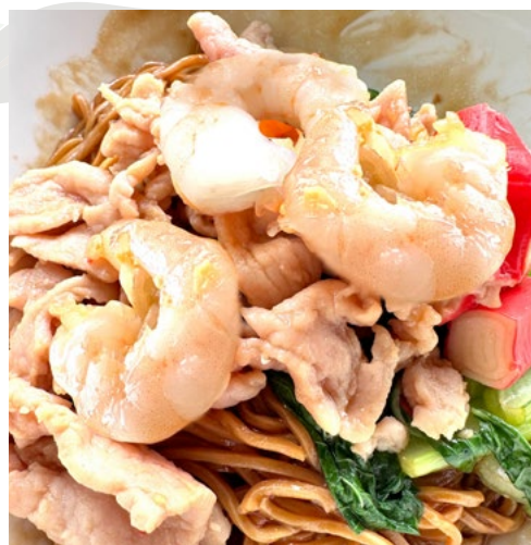
Stir-Fried Yee Mee with Prawn & Sliced Pork