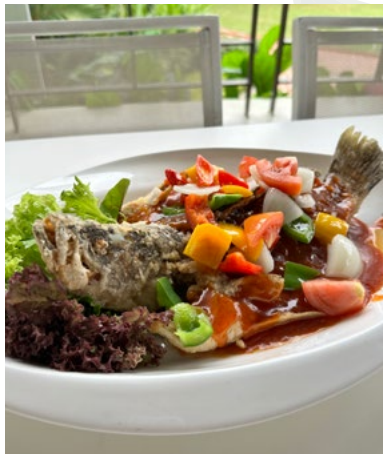
Deep-Fried Seabass with Sweet & Sour Sauce