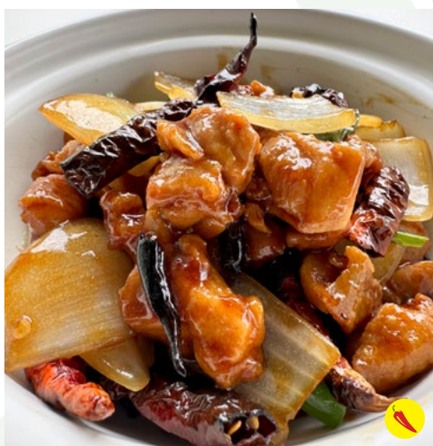
Claypot Kung Pao Chicken