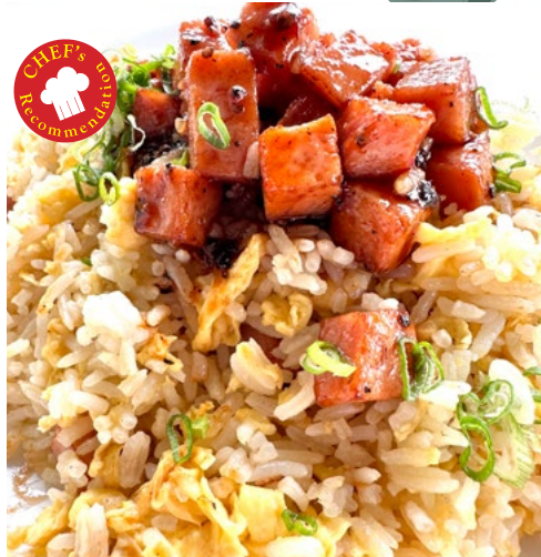
Black Pepper Salmon Cube Fried Rice