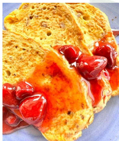
French Toast with Strawberry Filling