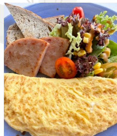
Egg Omelette with Ham