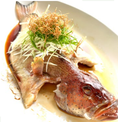
HK Style Steamed Red Garoupa