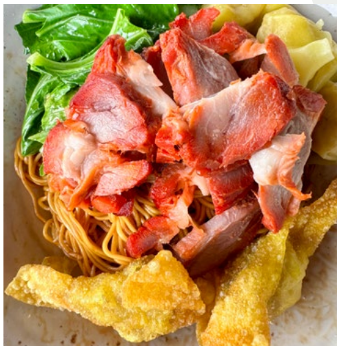
Wonton Noodle (Dry or Soup)