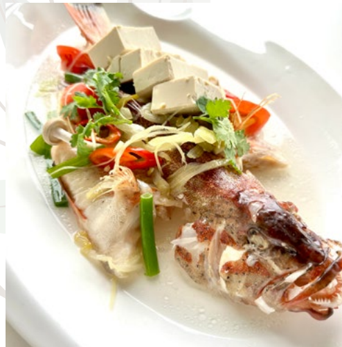
Teochew Steamed Red Garoupa