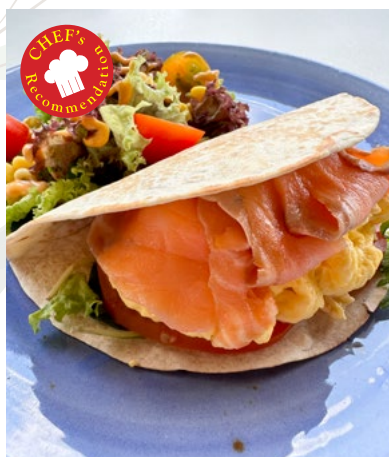
Scrambled Egg & Smoked Salmon on Tortilla