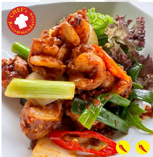
Prawn Ball with Mala Szechuan Sauce