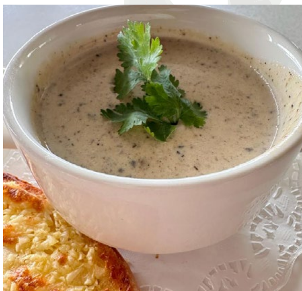
Cream of Mushroom with Garlic Bread