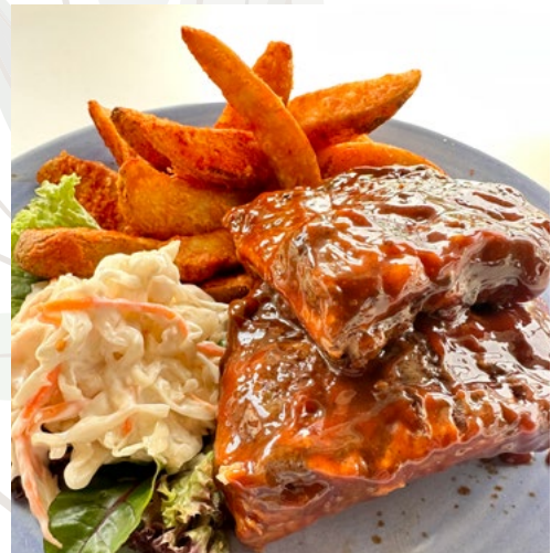
BBQ Pork Ribs