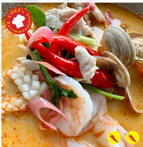
Hot Pot Trio Seafood with Thai Sauce