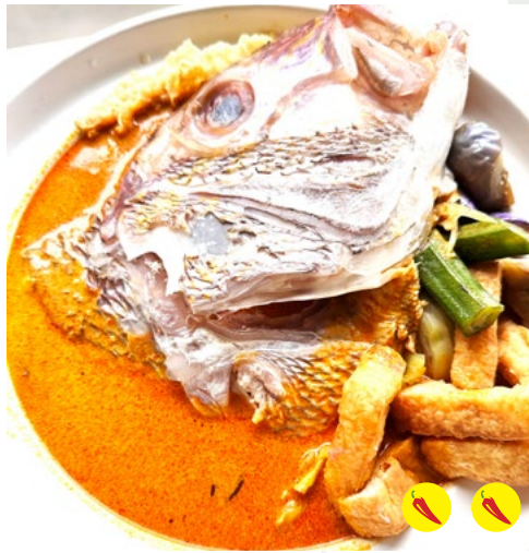
Warren Curry Fish Head