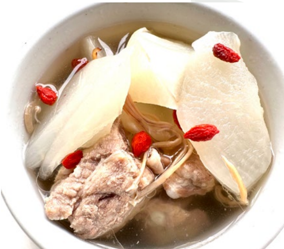
Double Boiled Pork Rib Soup with White Turnip