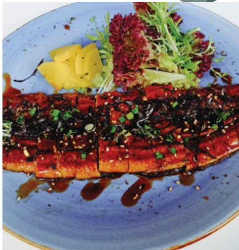
Unagi Kabayaki (Grilled Eel)