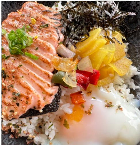
Aburi Sake Mentai Don