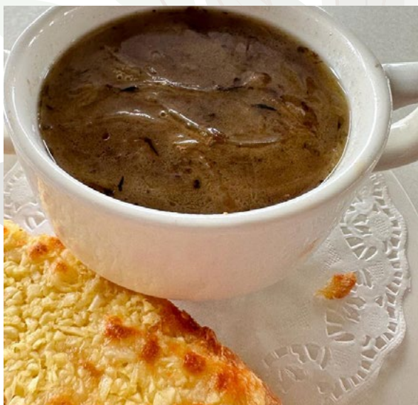
Onion Soup with Garlic Bread