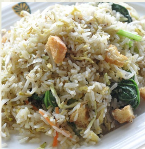
Vegetable Fried Rice