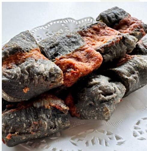
Otah Charcoal You Tiao