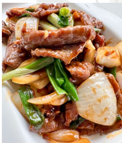
Stir-Fried Sliced Beef with Ginger & Onion