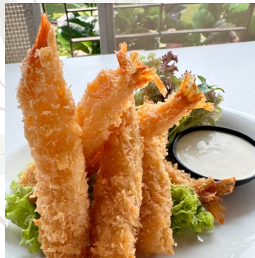
Fried Ebi with Wasabi Mayo