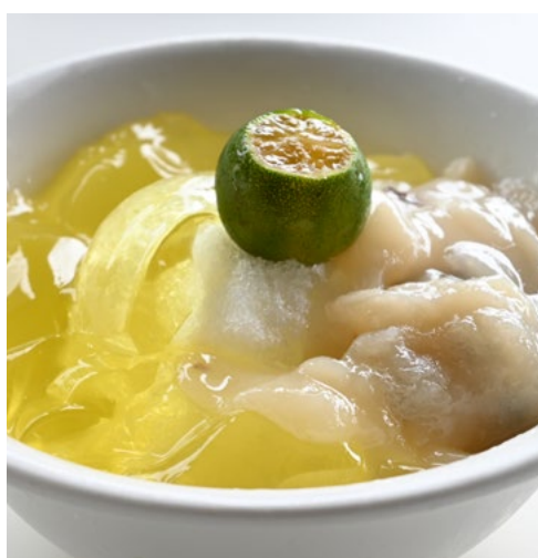
Ice Jelly with Soursop