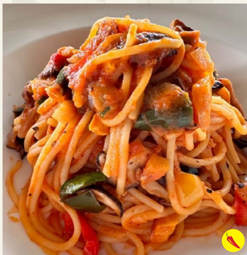
Vegetable Arrabiata Pasta