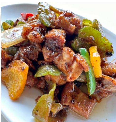
Fried Black Bean Chicken with Bitter Gourd