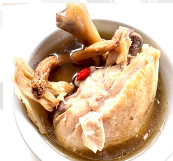
Double Boiled Chicken Herbal Soup