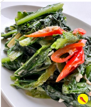
Stir-Fried You Mai Cai with Fermented Beancurd