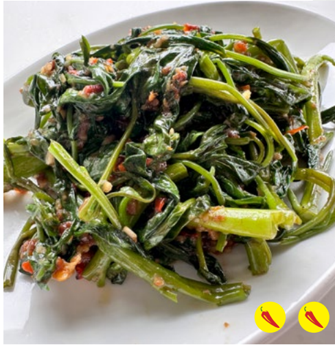
Sambal Kang Kong