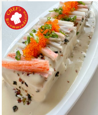
Cold Wasabi Tofu