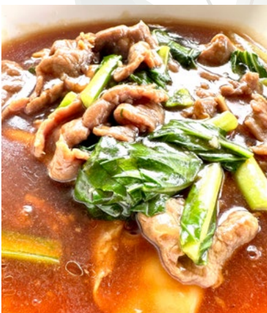
Beef Hor Fun