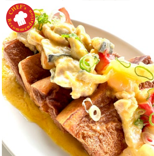
Deep-Fried Seafood Beancurd with Pumpkin Sauce