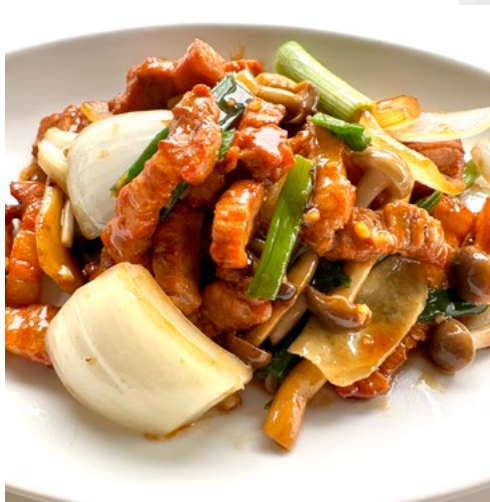
Iberico Pork Cubes with Ginger & Onion