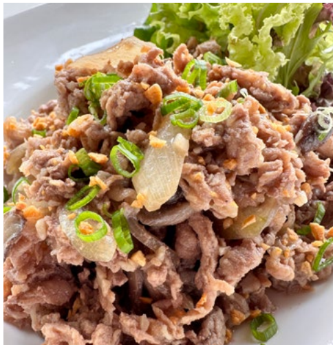
Truffle Yakiniku Beef