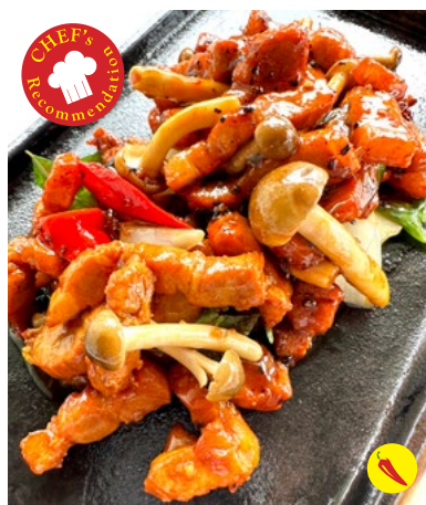
Hot Plate Black Pepper Iberico Pork Cubes