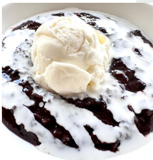
Cold Black Glutinous Rice with Coconut Ice Cream