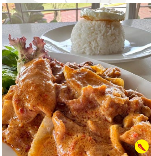
Dry Curry Sliced Pork with Rice