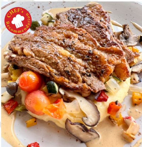
Iberico Pork Belly with Creamy Black Pepper Sauce