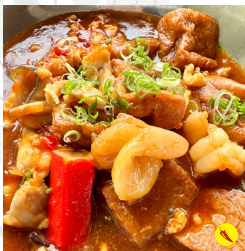
Yu Xiang Beancurd Puff with Seafood & Minced Pork