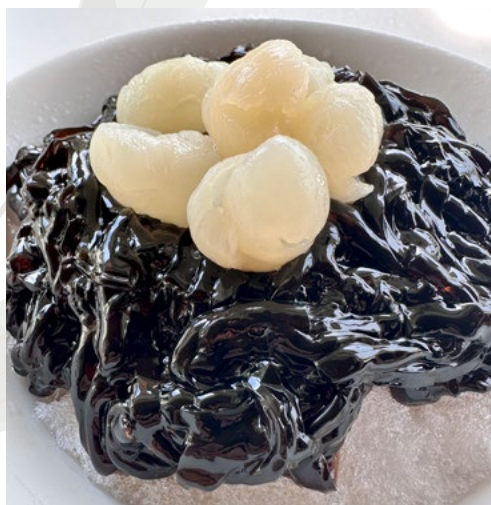
Chin Chow Longan / Attap Seed