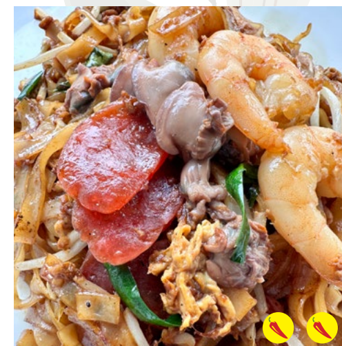
Penang Fried Kway Teow