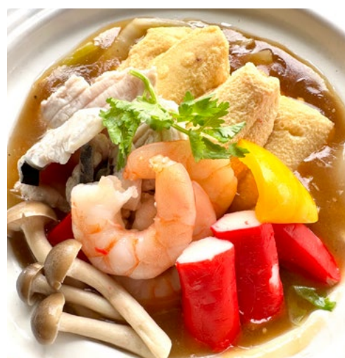
Claypot Beancurd with Seafood