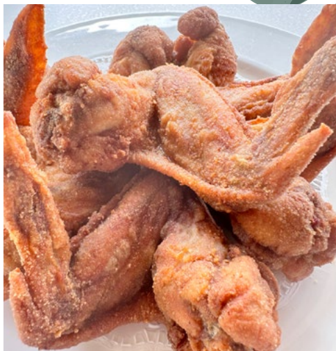
Original Chicken Wing