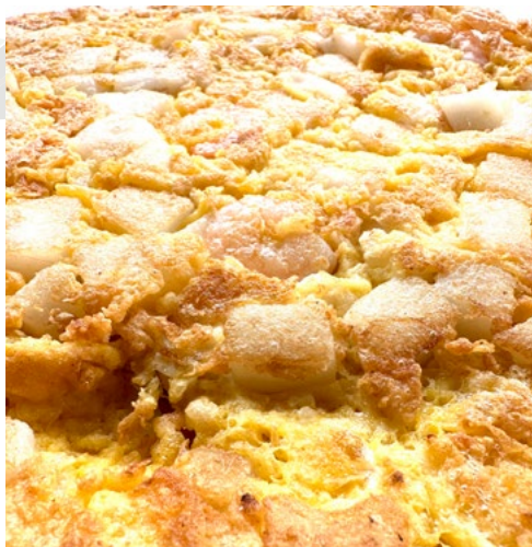
Fried Carrot Cake (White)