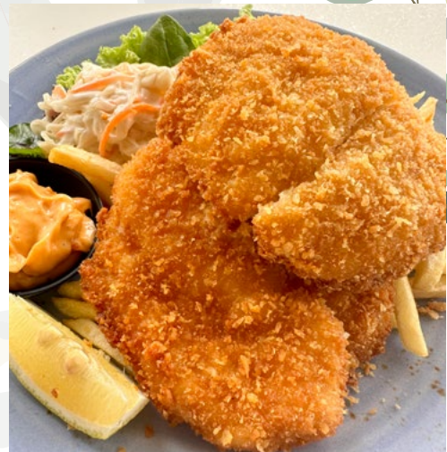
Fish & Chips