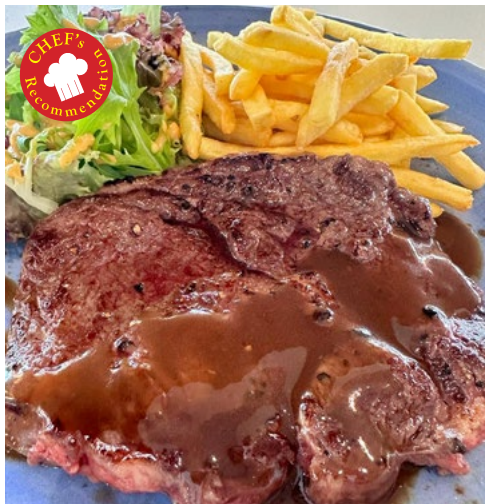
Ribeye Steak with Brown Sauce