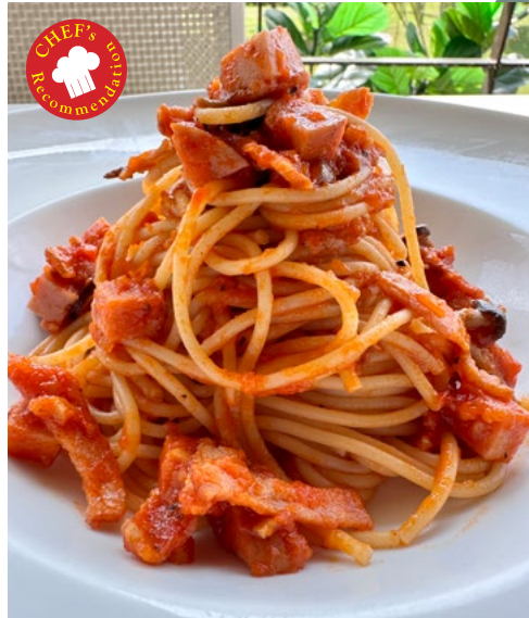
Pork Salami & Bacon Pasta