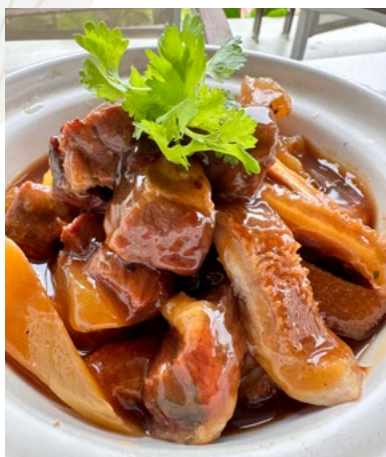
Claypot Braised Beef Brisket & Beef Tendon