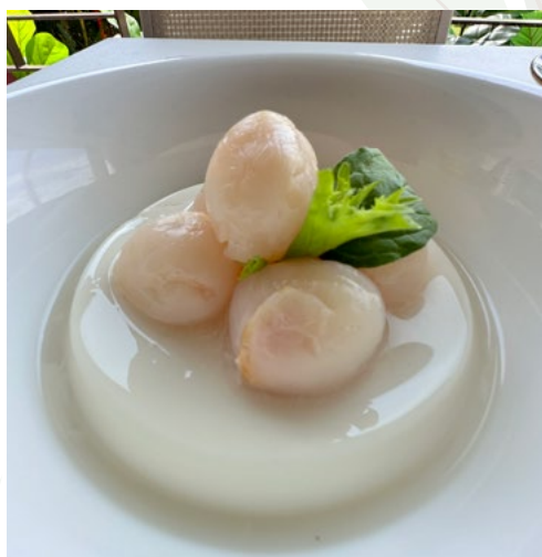
Soya Beancurd with Lychee