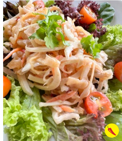
Jelly Fish Salad