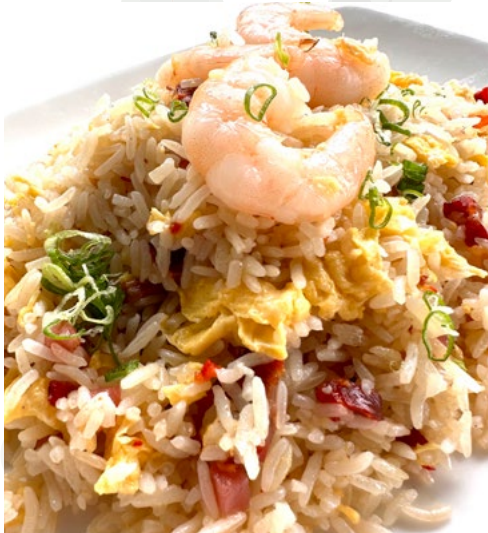
Yang Chow Fried Rice