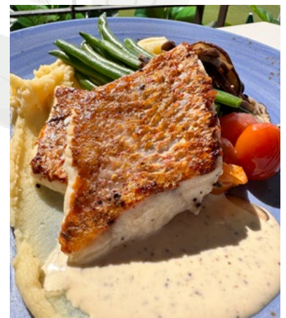
Pan-Fried Red Snapper Fillet with Honey Mustard