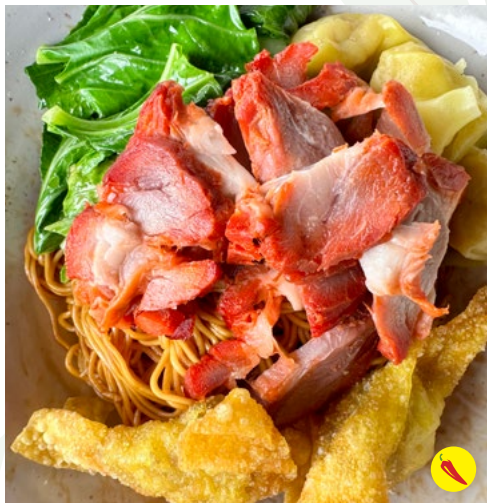
Wonton Noodle Dry

(Breast) Member $10.50 / Non-member $12.00 (Drumstick) Member $12.50 / Non-member $15.00