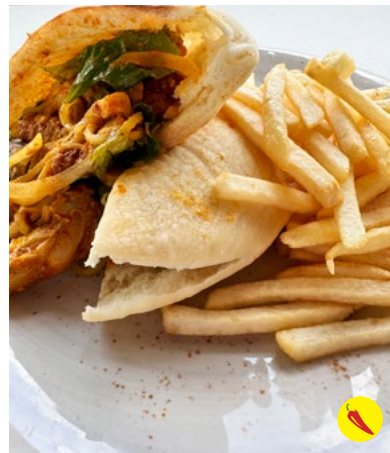
Tandoori Chicken with Pita Bread