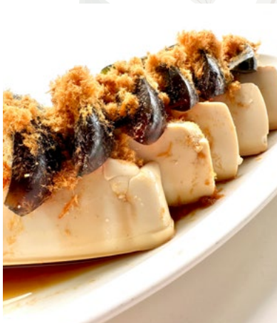
Cold Beancurd with Century Egg & Pork Floss