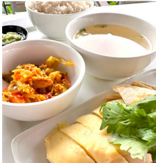
Hainanese Chicken Rice

(Breast) Member $10.50 / Non-member $12.00 (Drumstick) Member $12.50 / Non-member $15.00