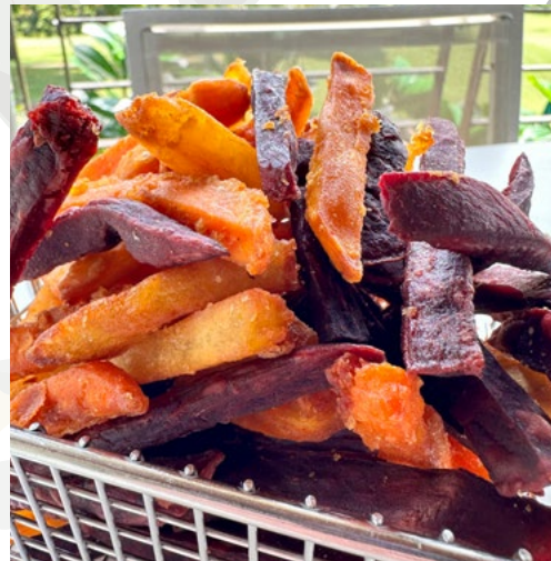
Trio Sweet Potato Fries