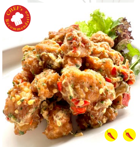
Deep Fried Chicken with Chilli Fermented Sauce