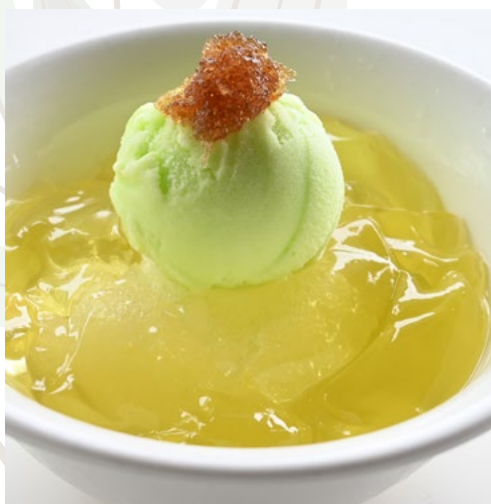
Ice Jelly with Lime Sherbet