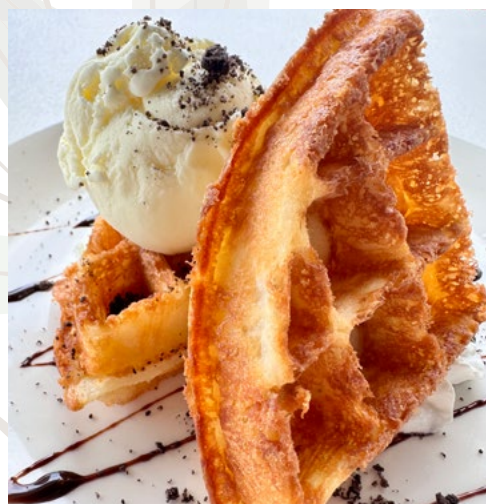
Waffle with Ice Cream