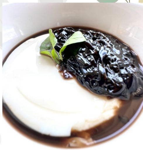
Black & White (Soya Beancurd Mix with Chin Chow)