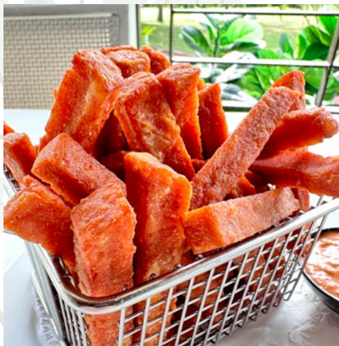
Luncheon Meat Fries with Garlic Sriracha Dipping Sauce