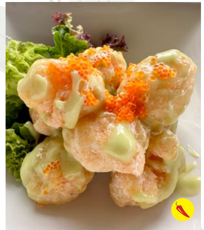
Wasabi Prawn Ball