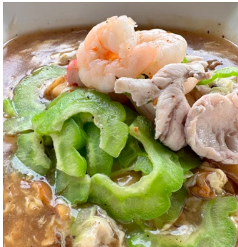
Seafood, Black Bean & Bittergourd Hor Fun