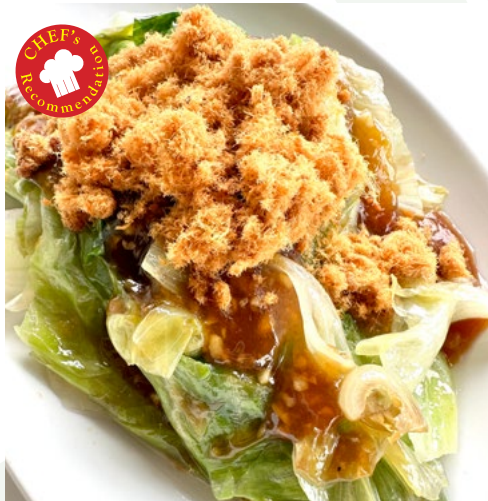
Iceberg Lettuce with Oyster Sauce & Pork Floss