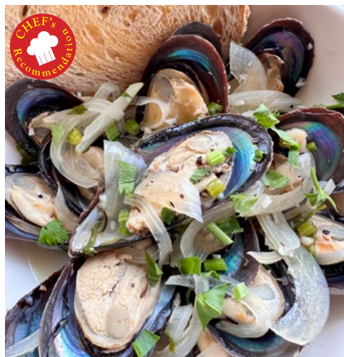
Mussels in Wine