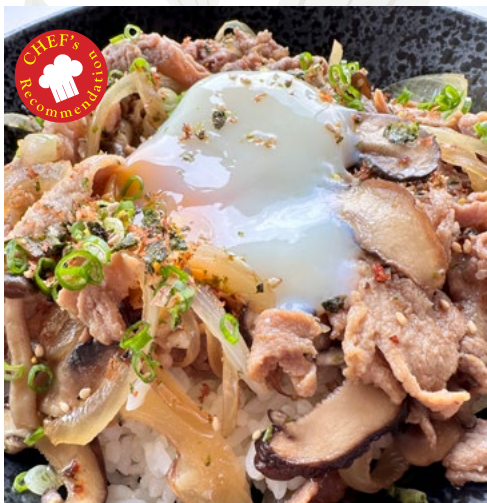
Truffle Iberico Pork Don