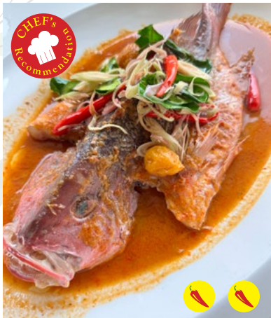
Thai Style Steamed Red Snapper