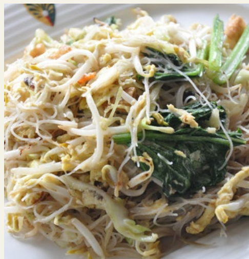
Vegetable Fried Bee Hoon