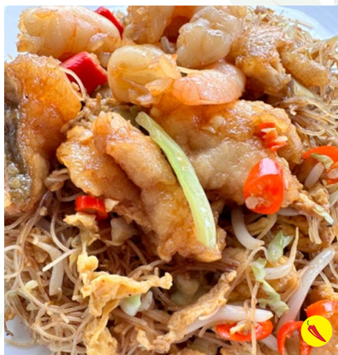
Ah Ma Seafood Fried Bee Hoon