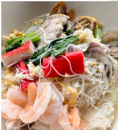
White Bee Hoon with Seafood & Clams