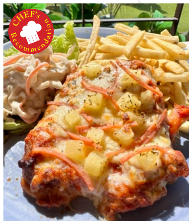
Aloha Chicken Chop