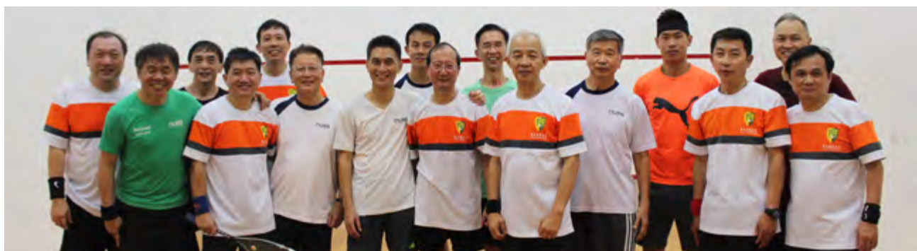
Thank you to our friends from NUSS for coming here for a game with us!