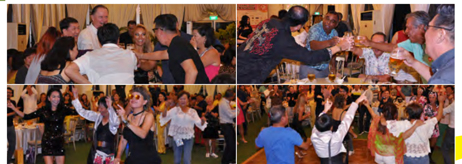
A night of cheers and dances!