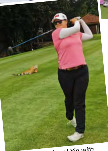
LPGA Pro Angel Yin with one of our resident iguanas