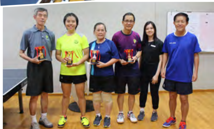
Our winners of this tournament