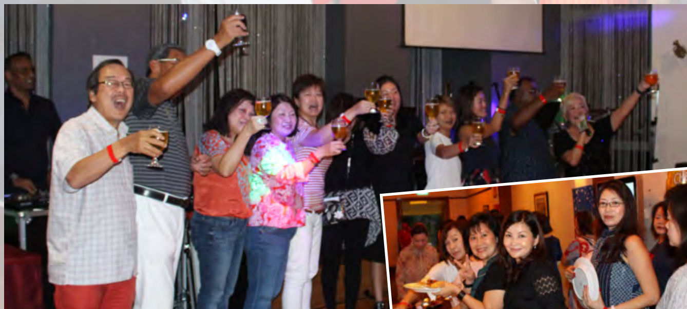
Members of the Management Committee and Social Sub-Committee thanking all for being a part of the night