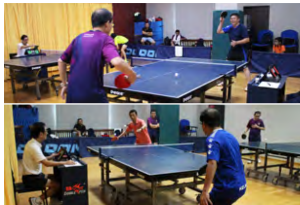
Players immersed in the game