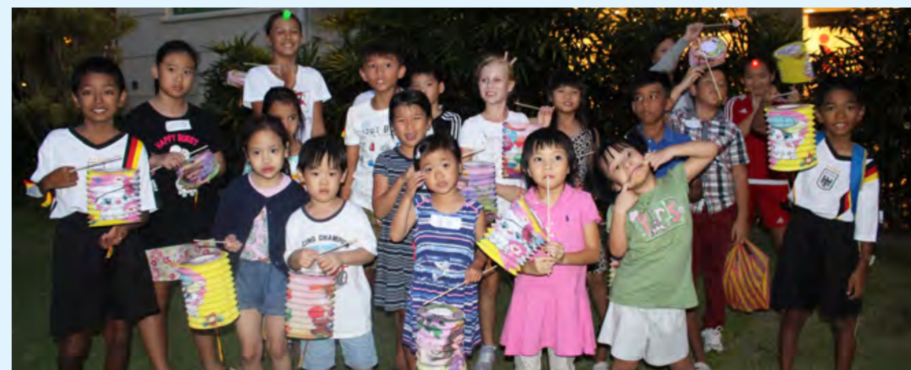
The sky getting dark just in time for the lanterns to shine!