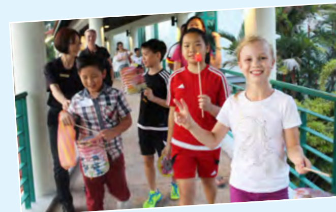
A "tradition" of the Club that we hope will continue for the years to come – lantern walk-around