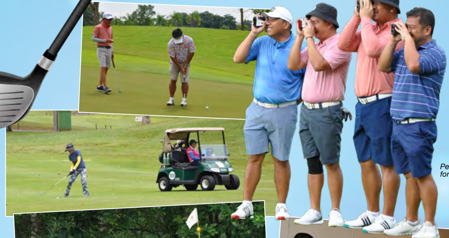
Perfect models for DMDs