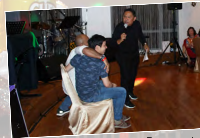
The emcee entertaining all with games