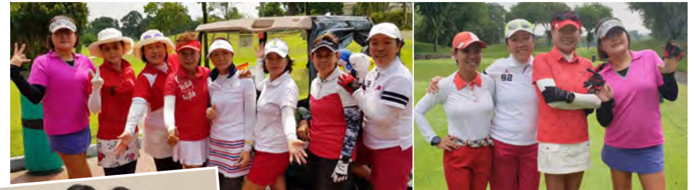
The ladies proudly dressed in red and white

It was the time of the year for the ladies to be dressed in red and white in this golf game to celebrate the nation's birthday!