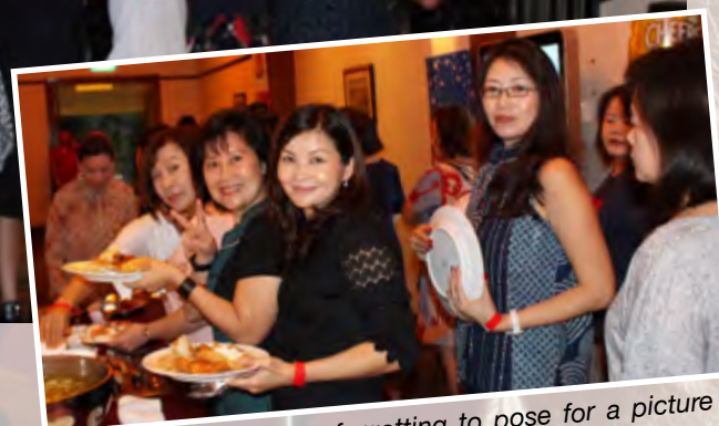
The lovely ladies not forgetting to pose for a picture during dinner time