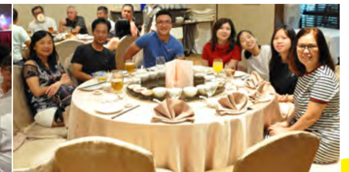
Golfers relaxing after the game at Yan Palace