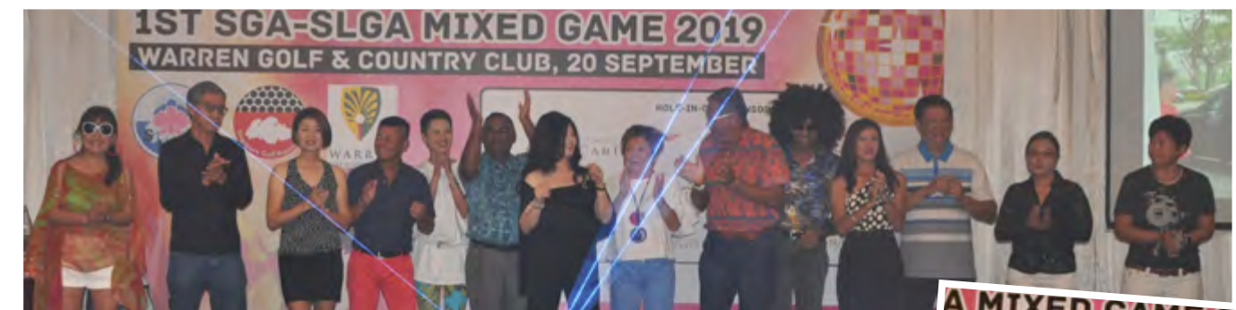
The Committee behind this awesome game