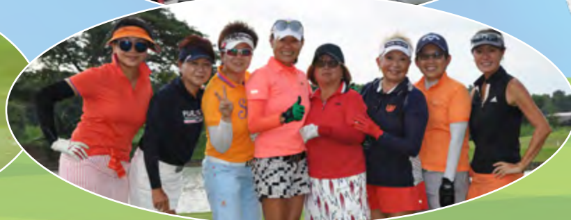
Our golfers having a great game under the great weather