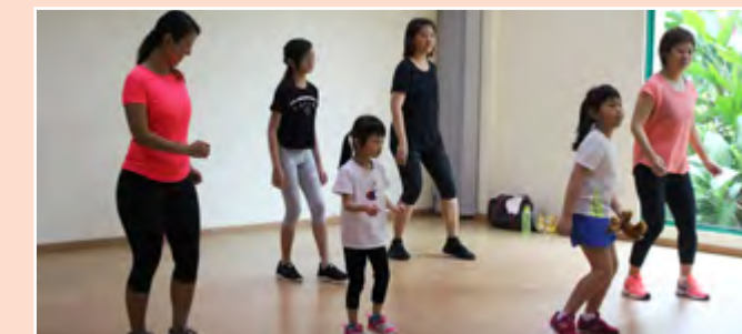
Girls just wanna have fun!