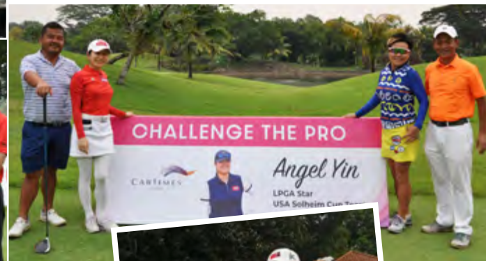
Looking cool everyone!