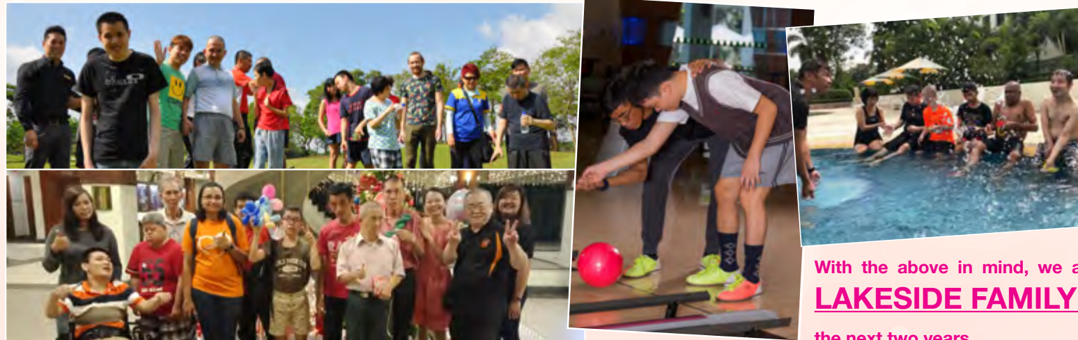
Some past activities organised for SUN-DAC clients

With the end of the second year, it is also time for us to bid farewell to our very first adopted charity SUN-DAC, a centre for the intellectually disabled located in Choa Chua Kang, as we end our two-year partnership with them. The Club has raised a total of $86,496 for SUN-DAC and also run several activities for them at the Club over these two years. We are glad that we have created a positive impact to the lives of SUN-DAC clients.