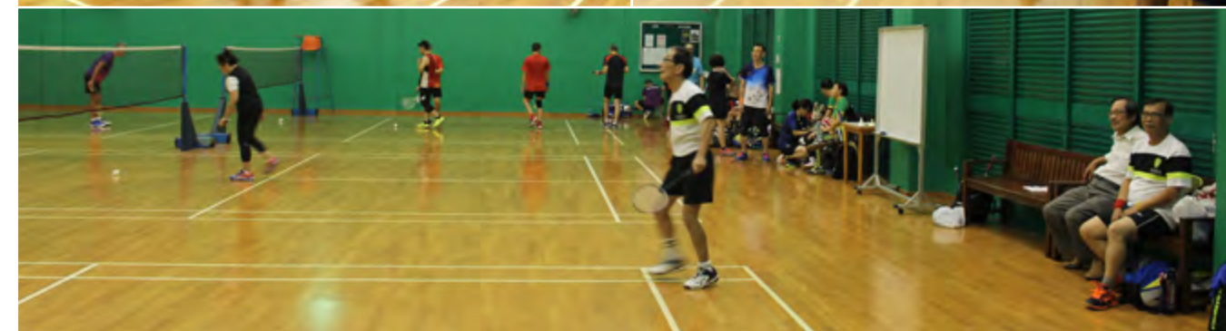
Smashing it out!