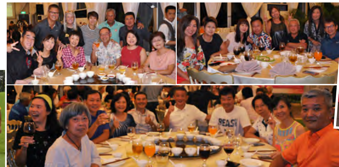
A roaring good time during dinner