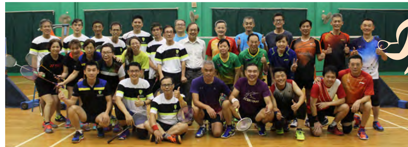
Big smiles from the players

The Badminton Hall on that Friday night was a scene of great smashing action with 45 badminton players from Warren and HongWen Team!