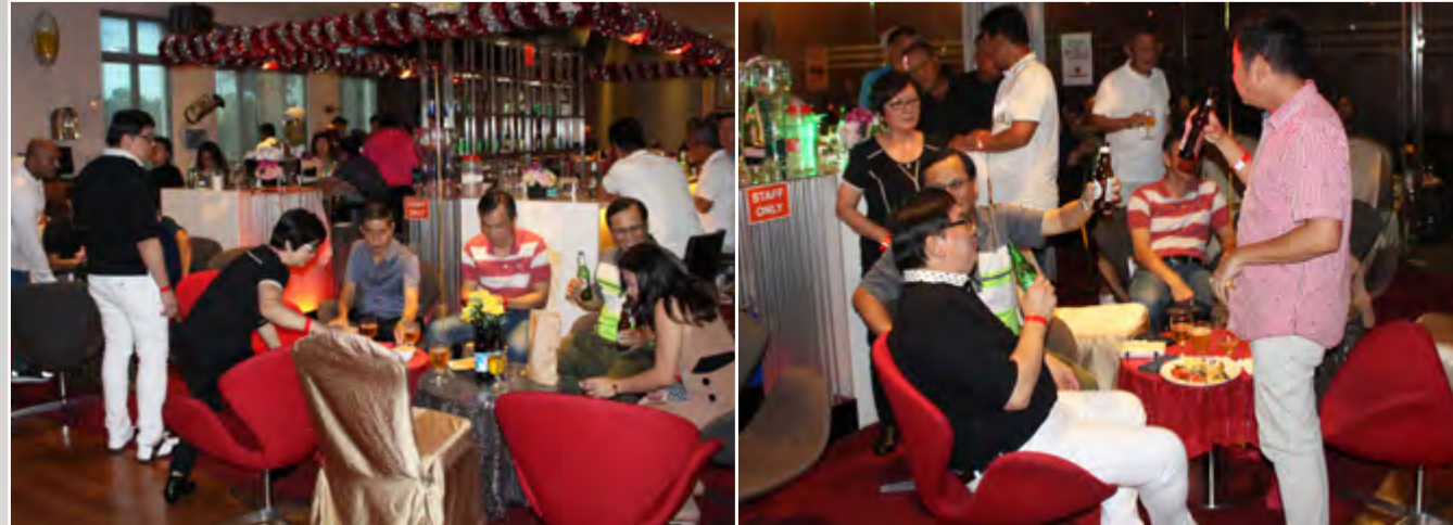
Members and guests enjoying themselves with their beer

It was a night of absolute fun for the 160 members and their friends who were part of this event. We are sure everyone had a BEERY great time at the Water Hazard!