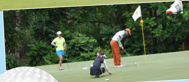
Let's swing it!