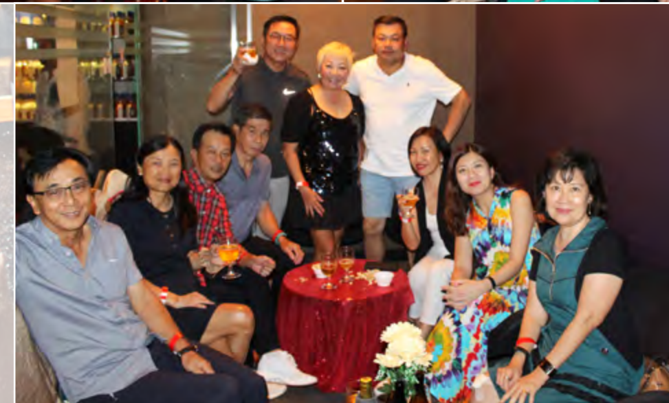
Beer and more beer to keep everyone happy the whole night!