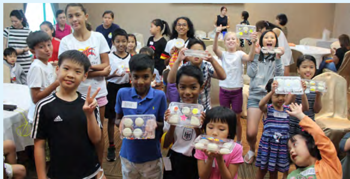
We are so proud of everyone's mooncakes!