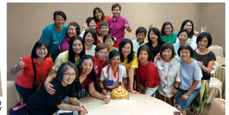
Group photo during lunch