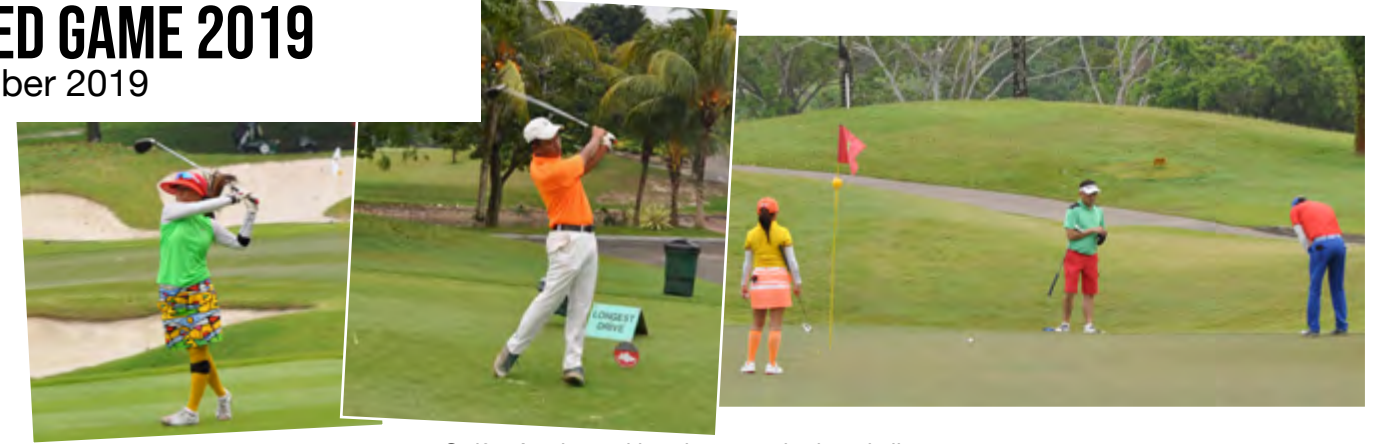
Golfers' attire making the game look real vibrant