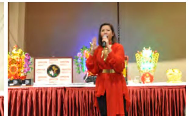
The emcee ready to begin the auction segment