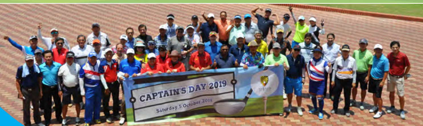
Thank you to all our golfers for your support of the Captain's Day!