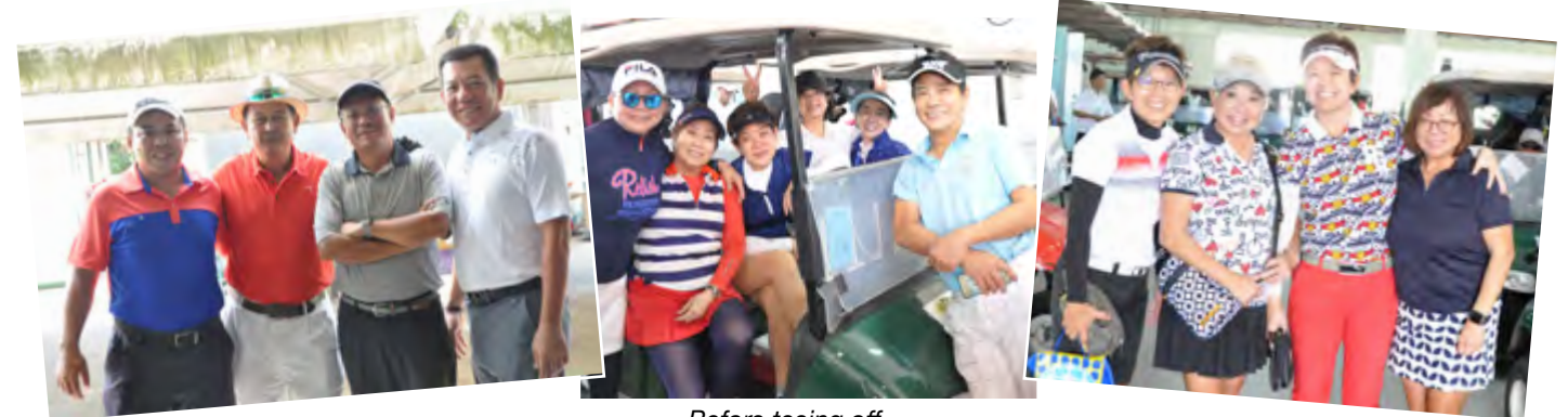
Before teeing off

This annual "traditional" event held to honour the lunar seventh month attracted full participation of 144 golfers this year. After an afternoon game, the golfers proceeded to Yan Palace for dinner and entertainment.