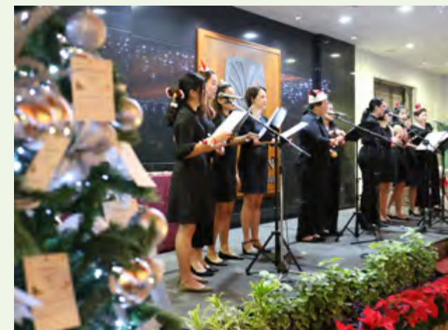
Christmas Light-Up on 23 November – a date not to be missed

Start your festive cheer with the Christmas Light-Up at the Club on 23 November. To ramp up the festive mood, this year's celebration will be a very special one as for the very first time, it will be brought to members together with our Annual Family Day. The Family Day will kick start at noon, with activities and programmes leading up all the way to the Light-Up in the evening. There's always something special about a White Christmas that is extra magical. This inspired us to come up with a “Snowy Christmas” theme for the Club this year. The Club will be transformed into a winter wonderland so come with your friends and family to soak in the wonderful atmosphere – we promise a jolly good time for all.